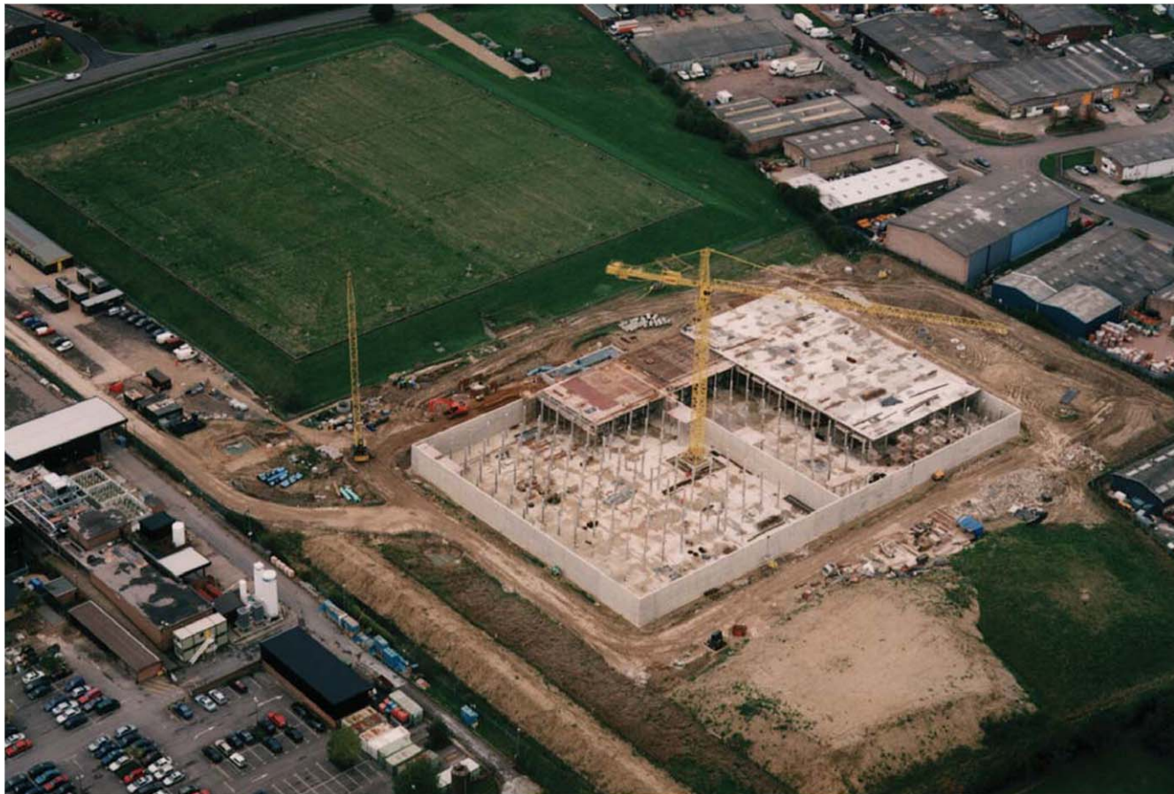
Bedford: Construction of new reservoir at Manton Lane

T he new 45,000m 3 Manton Lane service reservoir – part of Anglian Water's £120 million capital investment programme for 2002, will store treated drinking water, providing 130,000 residents of Bedford and surrounding area with a secure water supply. Built in 1930 as open asphalt lined storage reservoirs and converted in 1949 to a covered service, the existing reservoir is nearing the end of its useful life and needed replacing to ensure the continued supply of wholesome water.