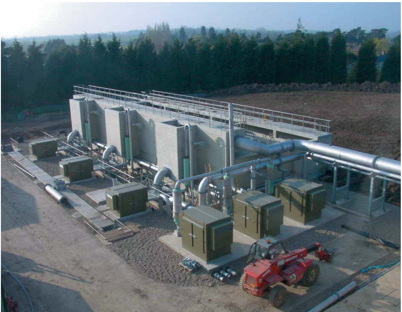
Biofor plant

E sex & Suffolk Water, part of Northumbrian Water Ltd., supplies drinking water to over 1.7 million customers of which 1.4 million are located in the Essex supply area. Essex is the driest county in the UK and needs to import 50% of the water it requires. To determine the best water resource option to meet present and future demand requirements, demand management initiatives, and new water resource schemes were considered. Adjacent Langford an existing pipeline transports wastewater from Chelmsford sewage treatment works and discharges it into the tidal River Chelmer near Beeleigh weir. An opportunity to recycle wastewater was identified at Langford and a pilot scheme was trialed which proved successful. Recycling was demonstrated to provide sufficient water sustainably, quickly and cost effectively with minimal impact on the environment. This innovative scheme is thought to be the first large scale example in the UK of planned indirect reuse of recycled wastewater.