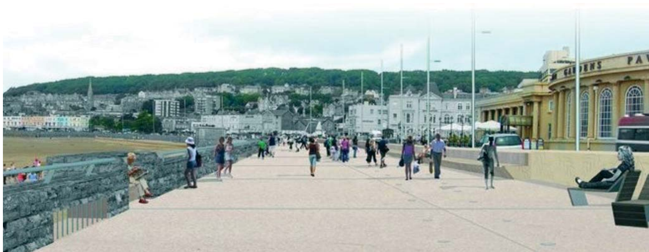
Phase 2 - Artists impression of parade & splash sea wall