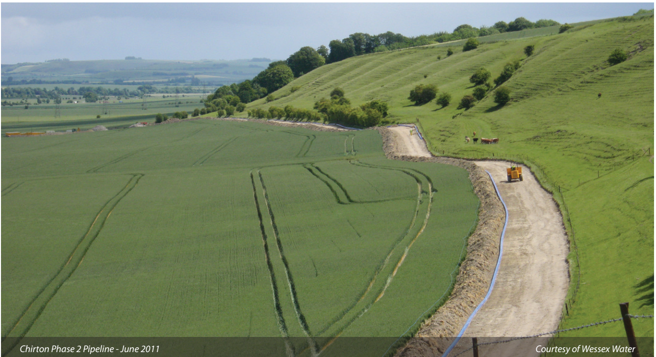
Chirton Phase 2 Pipeline - June 2011

A significant number of Wessex Water customers in the north and east of the supply area are supplied from either borehole or spring sources. These historically have been relatively small sources, supplying local communities in relative isolation to the rest of the supply area. Over time, the supply network has been expanded to link up most of the sources, but there still remain a number of isolated supply areas like Chirton that, due to their remoteness, have remained as standalone. The Chirton works is a groundwater source located on the northern edge of Salisbury Plain, south east of Devizes. The source pumps up to Chirton distribution reservoir which supplies a local population of around 5,000 people.