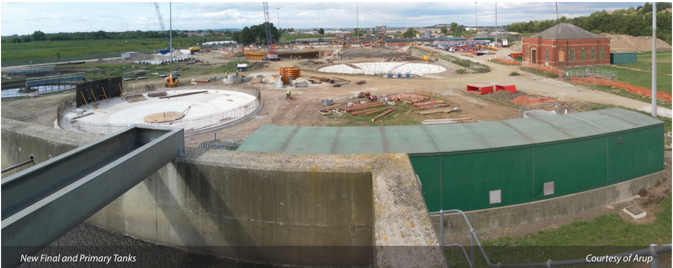
New Final and Primary Tanks

Calder Vale WwTW serves the bulk of metropolitan Wakefield in West Yorkshire, with a population projected to increase to roughly 110,000, against a background of fairly stable industrial activity. During AMP5, the works is being upgraded to meet a new consent of 3mg/l ammonia as a result of the Freshwater Fisheries Directive. In parallel with this obligation, Yorkshire Water (YW) has developed a sludge strategy which has identified opportunities in refurbishing and expanding renewable energy production at a number of regional anaerobic digestion sites.