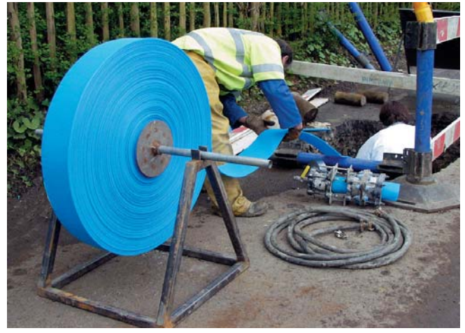
PE Liner prepared for insertion

Solution was a subject to excessive vibration from traffic. Excavation would fracture the main once the supporting ground was removed.