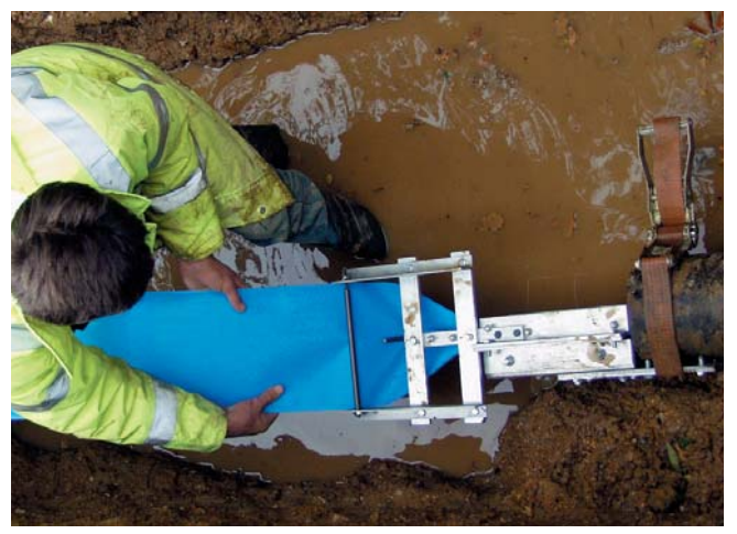
PE Liner prepared for insertion