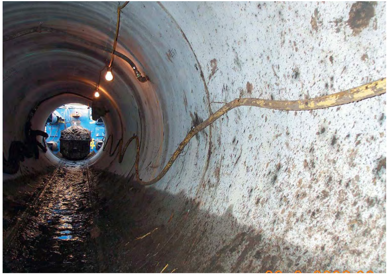
Hornsea: Sea outfall thrust bore

For the population of 25,000 PE during the most popular holiday weekends. At present, crude sewage from Hornsea is collected into a large pumping station situated on the town's foreshore, screened and discharged via a long sea outfall of plastic pipe construction which has been subject to flotation problems in the past. Storm flows are discharged into a short sea outfall. Crude sewage from the nearby coastal village of Mappleton is discharged to sea via a short sea outfall. As part of Yorkshire Water's 'Pride in Yorkshire's Coastline' programme, a scheme is underway to ensure Hornsea bathing waters comply with the Bathing Waters Directive and its waste water discharges comply with EC Urban Waste Water Treatment Directive. The project is the combination of two schemes.