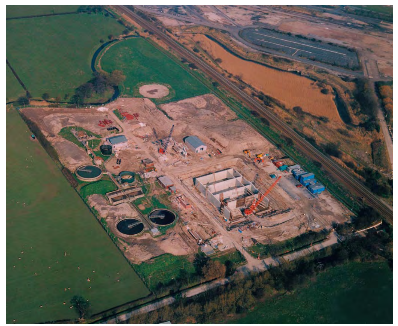
Aerial view of Llanasa WwTW

he existing Prestatyn catchment currently receives preliminary treatment with discharge to sea via a long outfall. The existing Llanasa catchment receives full biological treatment, though this works has now reached the end of its design life. The Prestatyn and Llanasa Scheme provides an agglomeration of the existing catchments at a new treatment works at Llanasa. The scheme is designed to comply with the UWWTD and enable the beach at Prestatyn to meet the guideline standard of the Bathing Water Directive. Discharge from the new wastewater treatment works on the Dee Estuary must also combine with the Shellfish Directive and existing unsatisfactory combined storm overflows in the catchment will also be addressed.