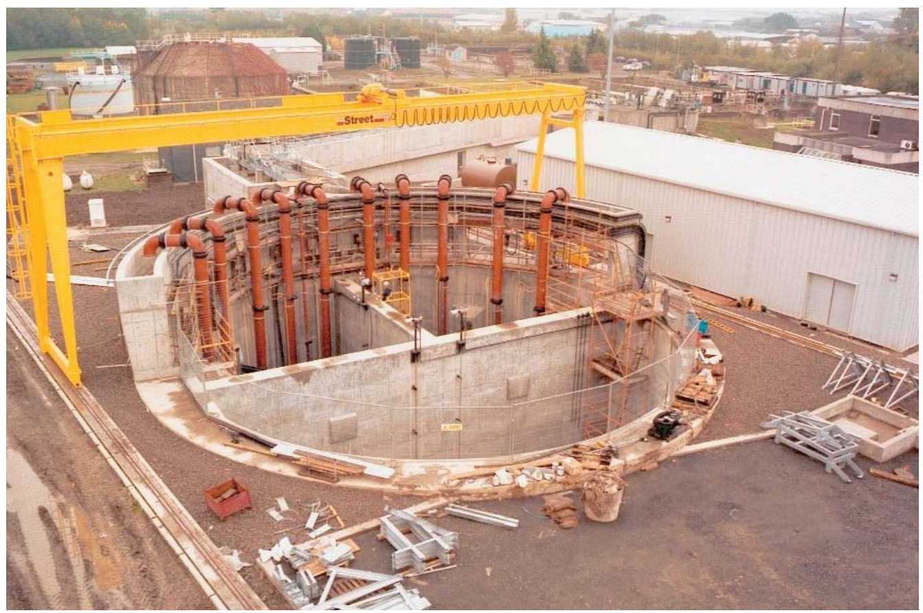
New pump station