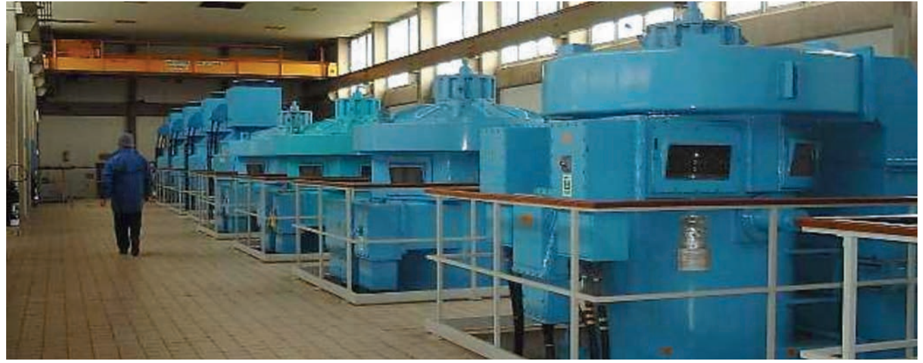
Franklaw WTW - Pumps in treated water house

s part of its current 5 year Asset Management Plan (AMP3) and in order to ensure compliance with impending regulatory requirements with respect to drinking water quality and wastewater discharges, United Utilities (UU) is pursuing a multi-million pound investment in Water & Wastewater infrastructure in North-west England. Three Framework/Partnering Agreements covering an area stretching from Carlisle to Chester have been procured. One of the largest water projects is being undertaken at Franklaw WTW near Garstang, Preston in Lancashire.