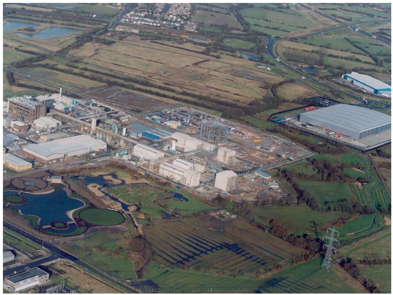
AstraZeneca Avlon Works