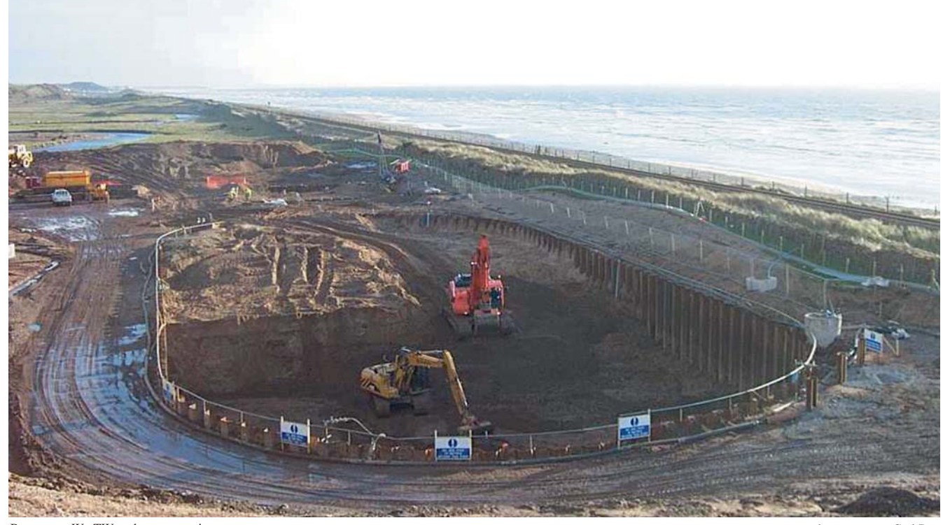
Braystones WwTW under construction

Braystones WwTW scheme, located in West Cumbria, incorporates the construction of a greenfield sewage treatment works, as a result of the EU Urban Waste Water Treatment Directive, and will treat wastewater from the villages of Egremont, St Bees, Nethertown, Thornhill, Beckermet and Braystones. At present sewage from these villages is discharged to sea with little or no treatment, with St Bees being the exception and receiving full treatment. The project consists of modification of the St Bees WwTW and construction of three new off site pumping stations. A new transfer main is to be constructed which will connect the pumping stations from Nethertown and St Bees and carry all of the sewage to a new works at Braystones.