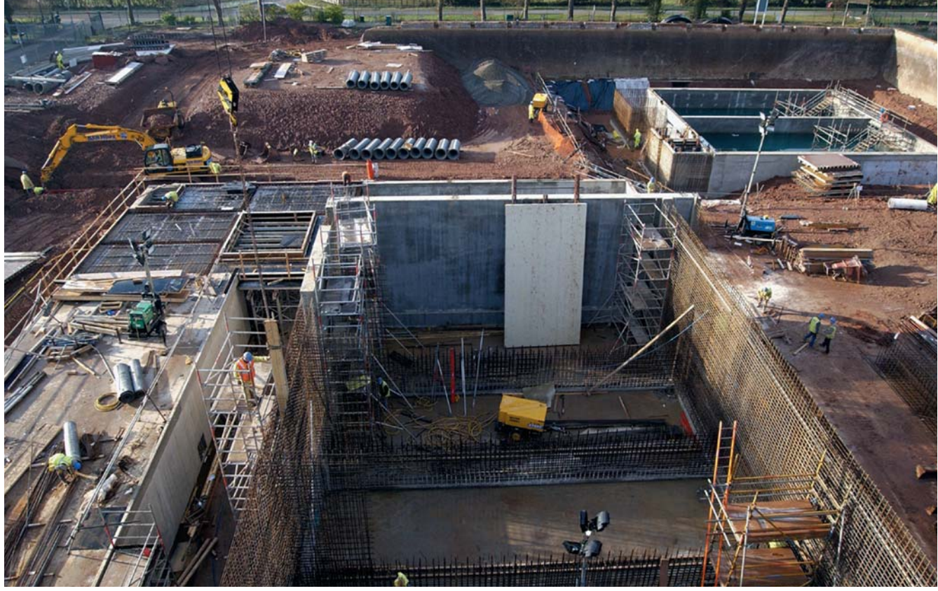
Cumwhinton: WTW under construction

umwhinton WTW, operated by United Utilities, supplies water to Carlisle and the surrounding area. In order to meet the company's latest guidelines for reducing the risk of Cryptosporidium breakthrough, the sludge treatment processes of the plant had to be upgraded. Whilst carrying out this work, the opportunity arose to upgrade plant capacity from 23 Mld to 27Mld and to improve inlet facilities on the River Eden from 23 Mld to 32 Mld.