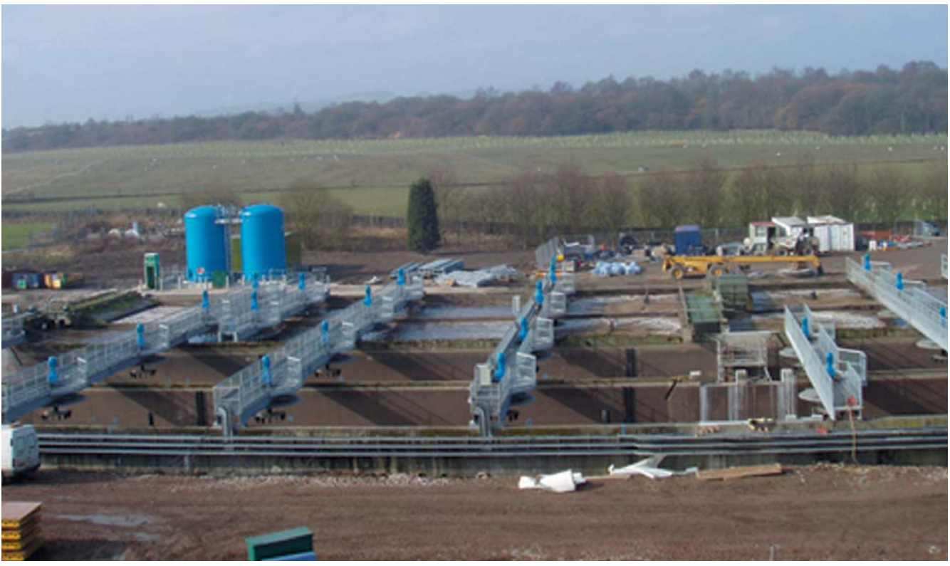
Hyndburn WwTW Quality & maintenance improvements

yndburn WwTW receives crude sewage via the Calder Valley, Hyndburn Valley and the Huncoat Sewers and serves an estimated population of 114,000 in the Great Harwood area of Blackburn, Lancashire. Effluent from the Hyndburn works discharges into the River Calder after treatment via inlet works screens, primary settlement, aeration and final settlement. As part of the River Quality Objectives, the Environment Agency require that the works achieve an improved effluent standard by 31st December 2004.