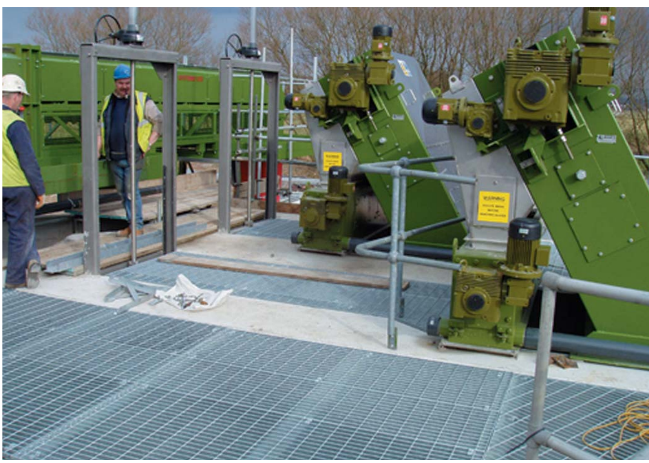
Hyndburn: Quality and maintenance improvements