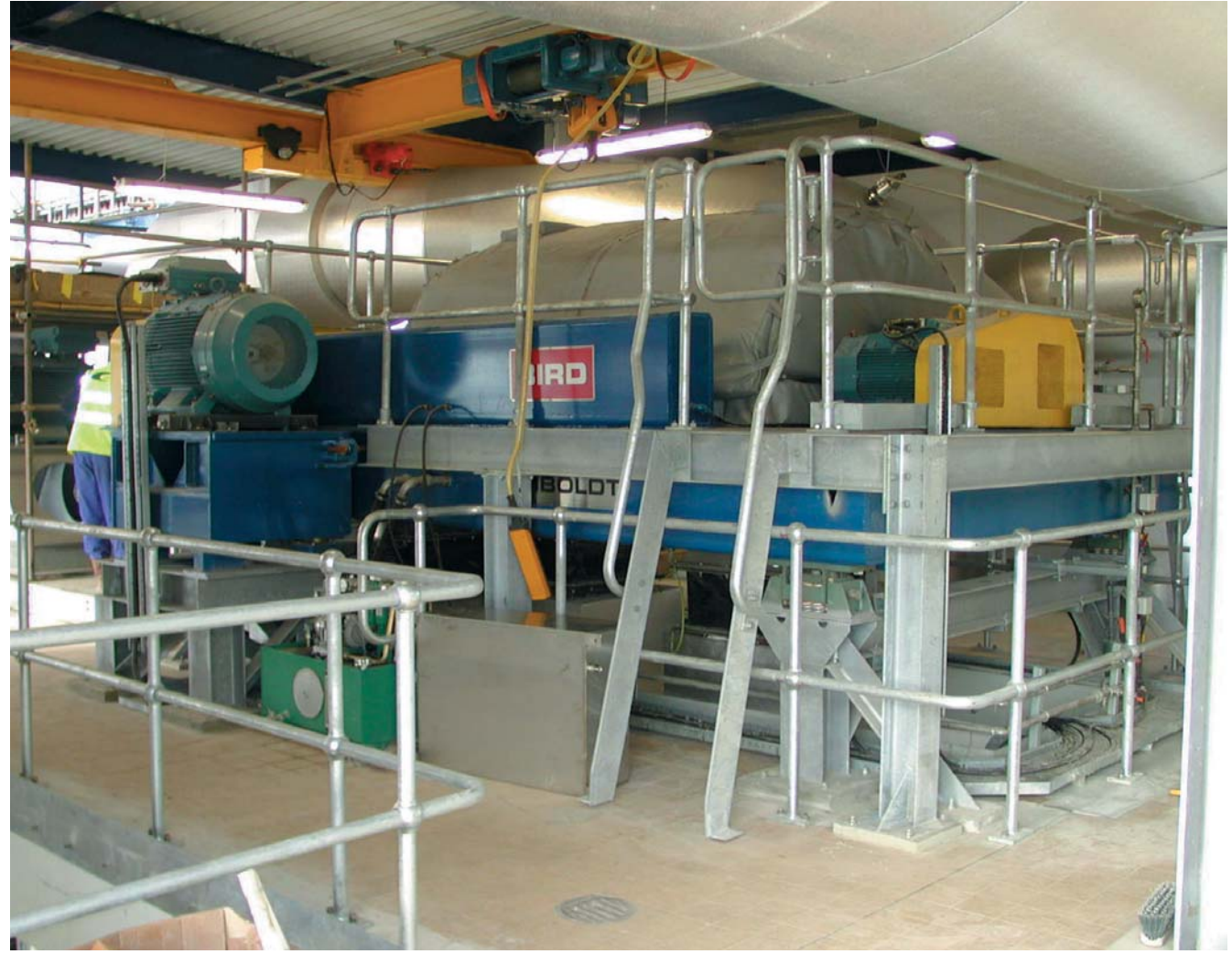
Worksop: New sludge dryer plant

While the introduction of ADAS Safe Sludge Matrix and proposed changes to the Sludge (Use in Agriculture) Regulations 1989, Severn Trent Water has recently completed an evaluation of a 'Centridry' enhanced sludge dewatering/drying process. Microbiological analysis was carried out on feed sludges and dried product and in all cases the microbiological content of the dried product was below levels of detection. Following the evaluation, it was decided to build a 'Centridry' Sludge Drying Plant at Worksop Sewage Treatment Works.