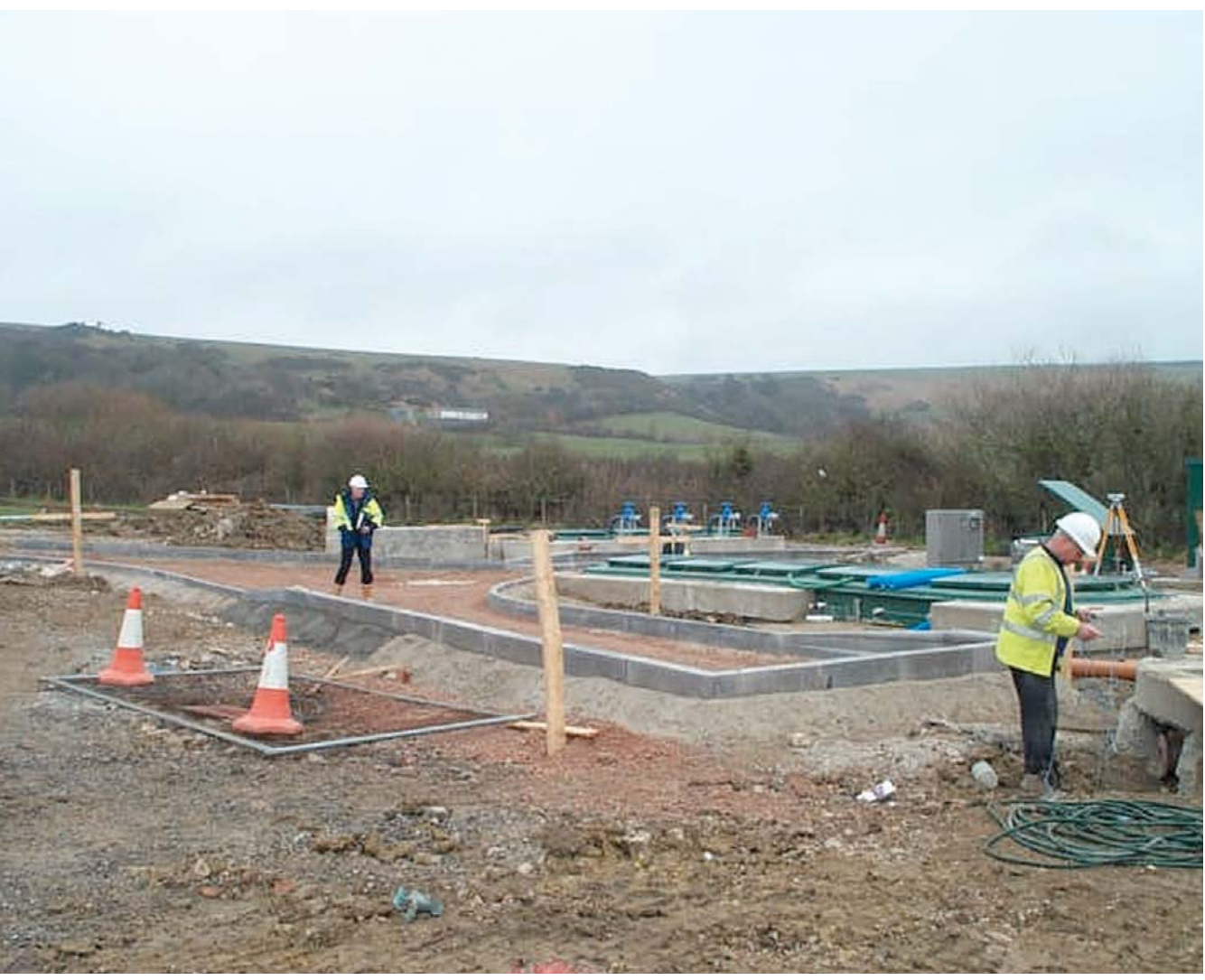
Ringstead STW

programming of works to minimise or avoid inconvenience and disruption to the inhabitants and their businesses during construction of the works. This was a serious concern shared by many property and business owners in the village. The period from Easter through to the end of the summer season is the busiest time and consequently sewerage works were timed to start at the end of the school summer holidays, September 2004, and be substantially complete before March 2005 Easter weekend.