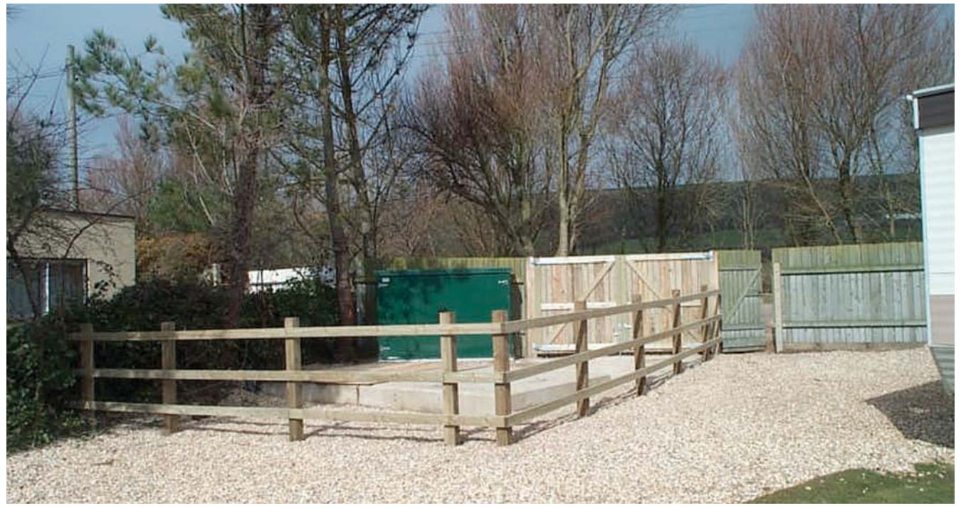
Ringstead STW

Ingstead Village, situated on the Dorset coastline at Ringstead Bay between Weymouth and Lulworth Cove is in an Area of Outstanding Natural Beauty, and the Purbeck Heritage Coast. The coastal slopes and various areas inland are registered as sites of Special Scientific Interest, SSSIs, and immediately to the west of the village is the listed monument of Ringstead medieval village covering an area of 12 hectare. The entire area is of significant environmental, archaeological and geological importance and roads running parallel to the shore form part of the South West Coast Path, very popular with walkers, which has unrestricted access throughout the year. However, before the inception of this Wessex Water scheme, Ringstead did not have an existing public sewerage system.