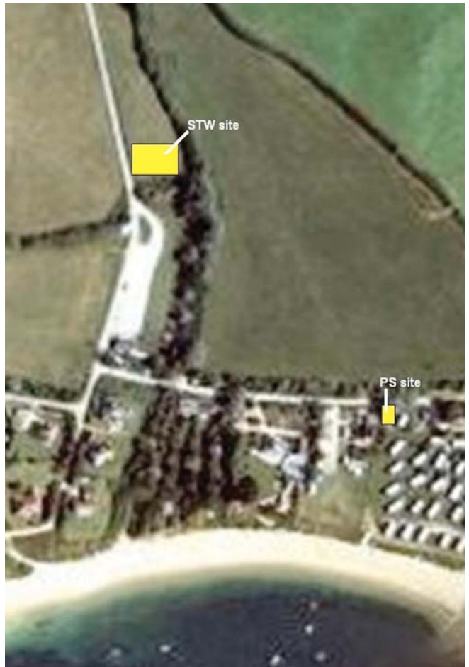
Ringstead STW: Aerial View of Ringstead Village