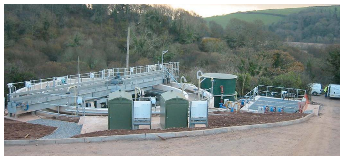
Slapton STW:Combining two village catchments for treatment before return to Torcross for discharge.

his £4.9m project was commissioned to design, construct and install equipment for a new pumping station at Torcross; to remove the raw sewage outfall; install 4.5km of twin pumping mains and upgrade the existing sewage treatment works at Slapton in line with the latest consent requirements of the Environment Agency, Special attention to environmental issues were most important as the work associated with the pumping mains and Slapton STW involved activity around Slapton Ley National Nature Reserve (largest freshwater lake in South West England, a Site of Special Scientific Interest (SSSI) and a bird sanctuary. Construction proved to be quite eventful with the unearthing of an old bomb and a live tank shell - both of which required the Bomb Disposal Team to make safe. The new pumping station at Torcrosss was sited under an hotel car park and all work had to be completed by Easter 2004 so as not to impinge on the hotel's seasonal trade. In addition public toilets sited in the hotel car park were converted to house the motor control centre and a new toilet block had to be located on the seafront car park.