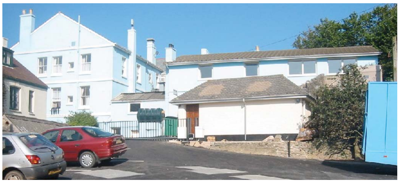
Slapton & Torcross: Torcross pumping station under hotel car park & MCC building is a converted toilet