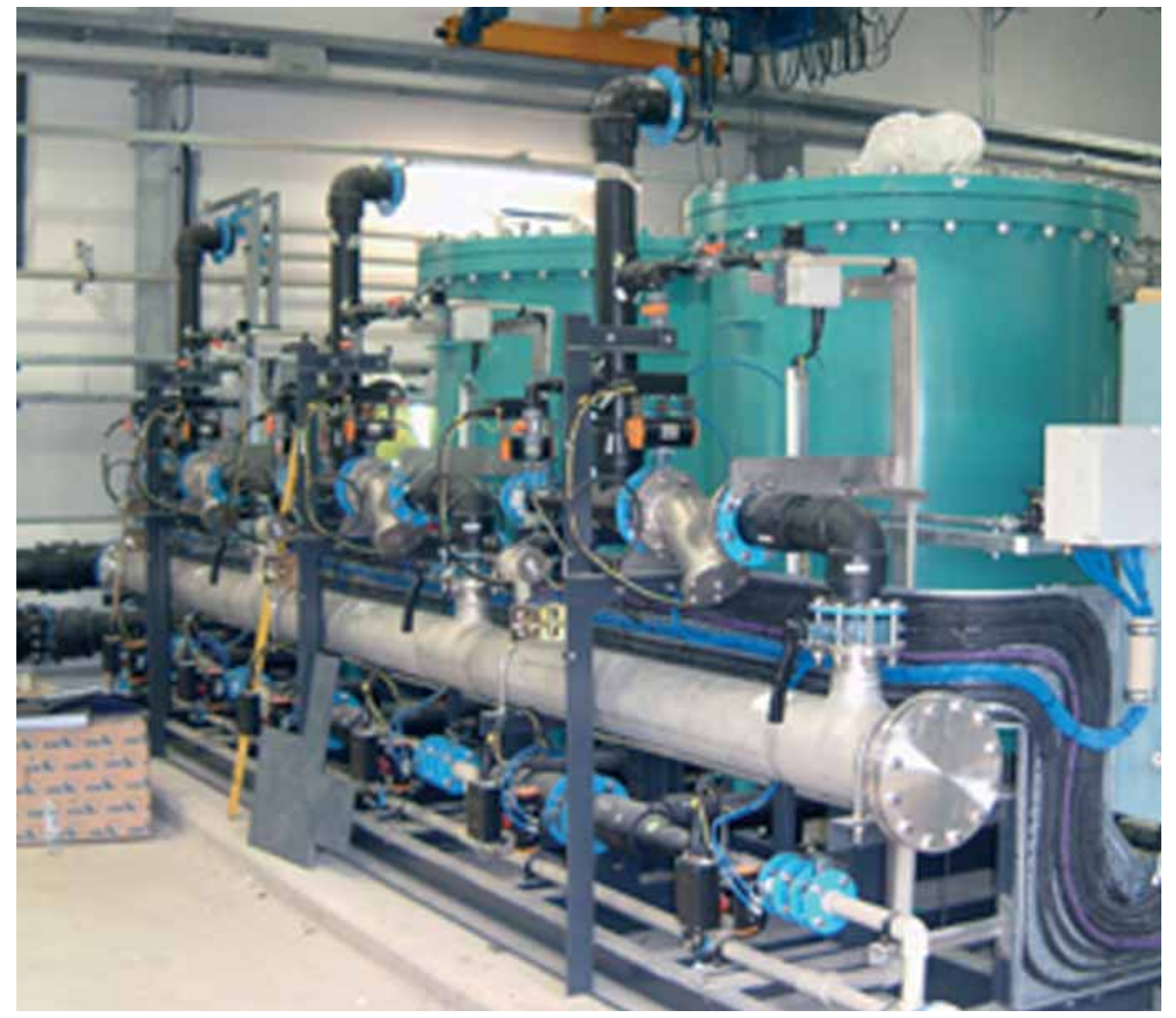
Clarendon Nitrate Reduction Scheme: Anion Skid inside new process building

larendon Park is one of Wessex Water's borehole sources of raw water, supplying some of the needs of the Salisbury area. With two boreholes and an average extraction of 8.6 Ml/d (licence is 14Ml/d), the water at this site has, in common with many other sites in the UK, seen a steady increase in nitrate concentrations over recent years - to the point where something had to be done. The Current peak nitrate concentration recorded at the site was 18.9mg/l as N, measured during the winter of 2001. Although values are generally much lower than this, the measured nitrate data trend line was indicating an increase of around 0.27 mg/l as N per year. Clearly action needed to be taken in order to be able to meet consistently the Wessex treated water target of 9mg/l N (Maximum Allowable Concentration (MAC) is 11.3 mg/l N)