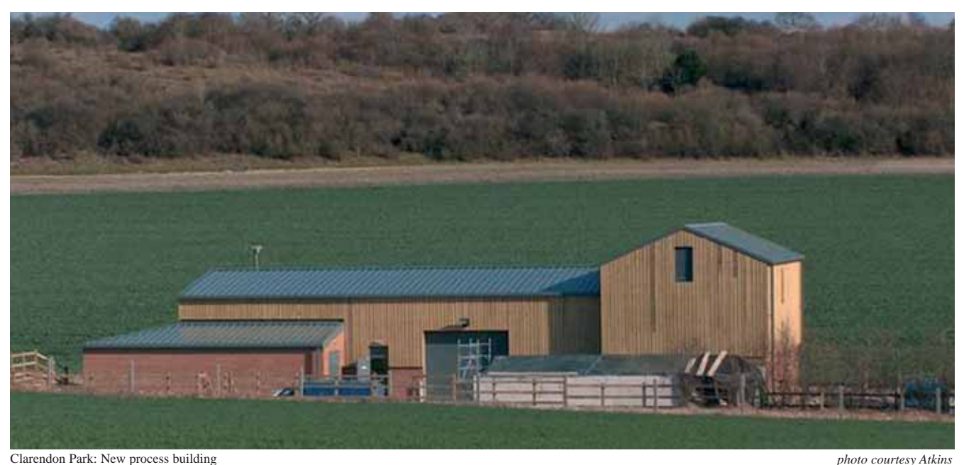
Clarendon Park: New process building

separate but interdependent plant, control and pipework layouts in the same building space. A cob-located team with representatives of the different designers was considered but ruled out within the time constraints, and instead, conventional design cob-ordination was used successfully