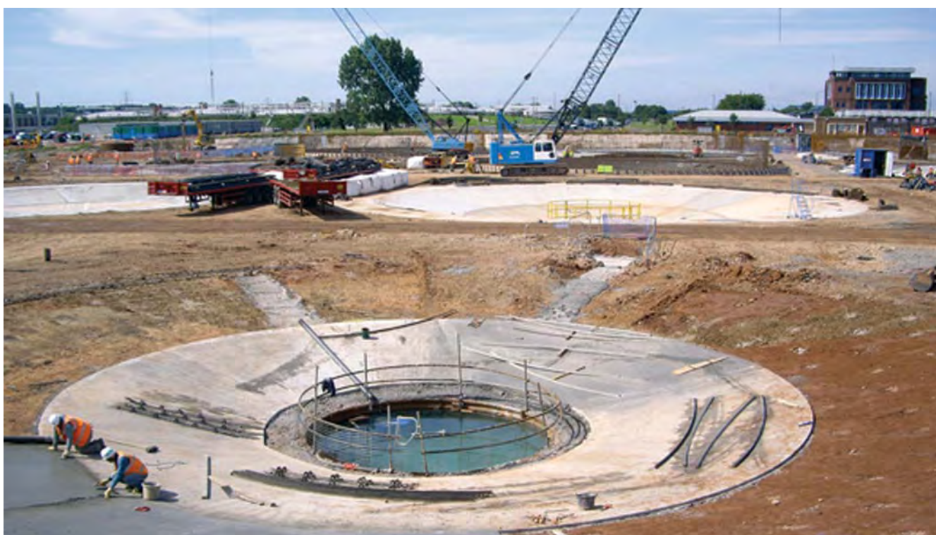
Minworth STW: Work ongoing for £100m upgrading scheme

M inworth Sewage Treatment Works, Severn Trent's largest STW treats sewage arising from a population equivalent of 1.75 million from Birmingham and the Black Country. The works also treats sludge arising from a population equivalent 2.5 million which is made up of the works indigenous sludge transferred by pipeline from the nearby Coleshill STW and sludges imported from smaller treatment works in south Staffordshire and north Warwickshire. The works will be extended and improved during the AMP4 period by two major schemes. The first phase will address a UWWTD UID requirement and will provide additional storm water storage capacity. The second phase will address a requirement under the Fisheries Directive, to meet the stricter discharge ammonia consent by the provision of additional activated sludge plant capacity and existing aeration plant upgrade. In addition to the two main phases, AMP4 includes a number of other schemes across the whole site including an extensive programme of replacement, refurbishment and improvements to existing assets identified by operational maintenance risk assessments, and three schemes to enhance the output of the existing site power station.