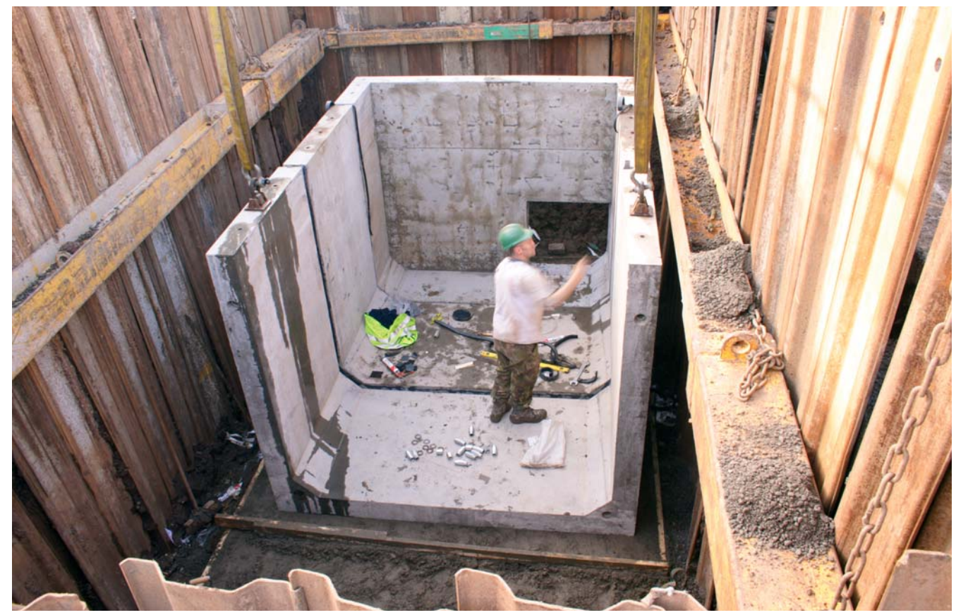
"CSO" in a Box? - innovative 'off the shelf design installed in a day rather than 10 days

C SO in a Box" - is an innovative, off-the-shelf and easily repeatable design solution - a practical application of engineering generating environmental improvement in wastewater projects. The pre-fabricated concrete Combined Sewer Overflow, (CSO) chamber is WaPUG compliant providing a quick and flexible CSO solution from familiar and proven materials. It can be delivered and installed in one day - a fraction of the 10-15 days installation time that a traditional CSO can require, reducing overall construction periods. Overall the 'CSO in a Box' improves efficiency and sustainability as well as meeting the specific needs of a project. It generates Health and Safety, programme, resource and environmental impact savings as well as reducing worker time in the ground and minimising disruption to customers.