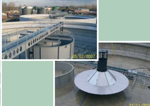
Varis Engineering Ltd was pleased to design, fabricate and install four Final Tank Scrapers for Stockport WwTW.