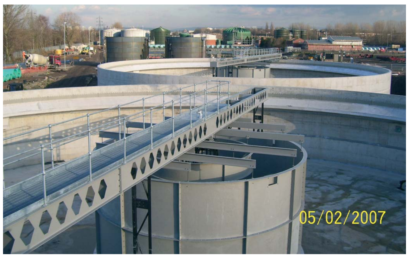
Stockport WwTW: Overview of works

tockport WwTW is included in the WwTW Quality Programme, for process enhancements to improve performance in relation to BOD, suspended solids and ammonia in line with the River Quality Directive. The future consent standard to be applied is 20mg/l BOD; 30mg/l SS and 10mg/l ammonia, and the Regulatory Compliance date is 30th September 2007. The existing process serves a population of 160,00 and utilises an activated sludge process to treat an FTFT of 160Ml/d. The original ASP stream, or Haworth Plant, was constructed in the 1920s and extended in the 1970s by the introduction of a further ASP stream known as the Simplex Plant.