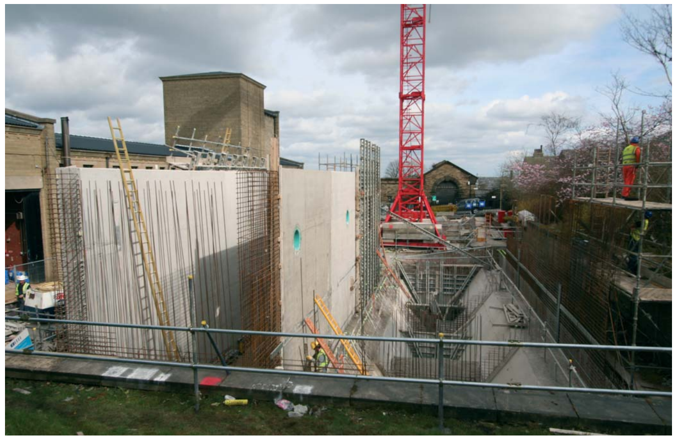
Albert WTW: Ongoing construction of the contactor and resin separation tanks

Ibert Water Treatment Works is a three stage 60 MLD works situated on a compact site to the west of Halifax, West Yorkshire serving a population of 155,000. Raw water is sourced from upland Pennine catchments. The existing treatment process was commissioned in 1988 and comprises of clarification by Dissolved Air Flotation (DAF) followed by Rapid Gravity Filtration (RGF) and pressurised secondary contact filters for Manganese removal.