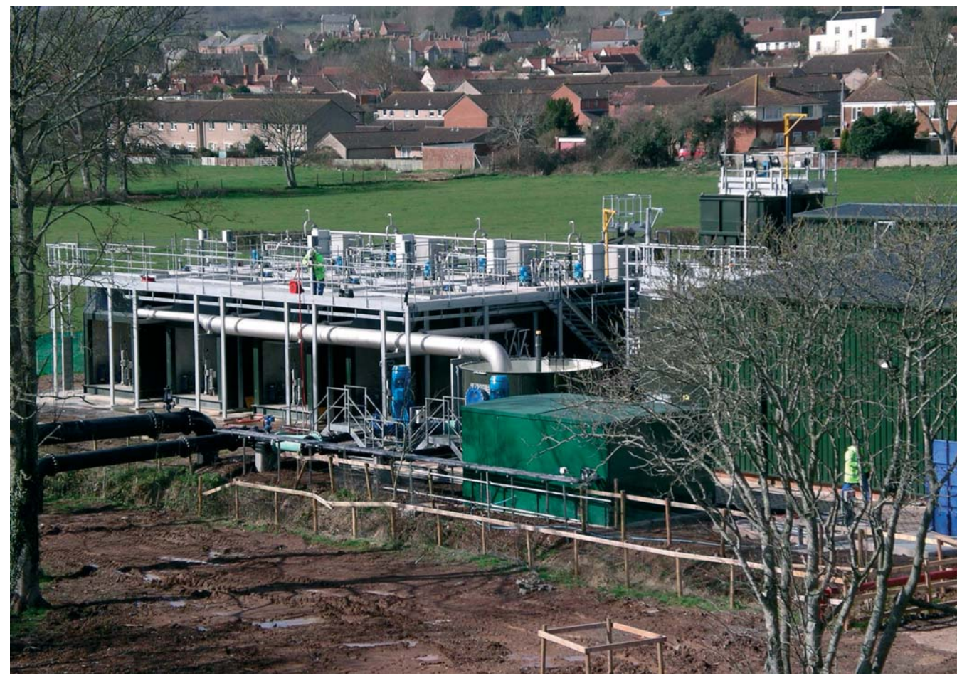
Axbridge: View of completed Actiflo® Pre-Treatment plant (plant building in foreground)

The existing works, located south east of Axbridge village and adjacent to the northern embankment of Cheddar Reservoir, comprises the pumping station to deliver reservoir supply to the local water treatment plant at Cheddar. During the dry summer of 2003 when water levels within the reservoir fell significantly, Bristol Water constructed an emergency sedimentation plant at Axbridge in order to reduce pressure on regional raw water resources by safely enabling the discharge of water from the River Axe into Cheddar Reservoir. Bristol Water is licensed to abstract up to 30 Mld between 1st of November and 30th April each year. This water is used to support Cheddar Reservoir, and as such forms part of the overall Company supply/demand balance; being also an important part of their drought contingency plan.