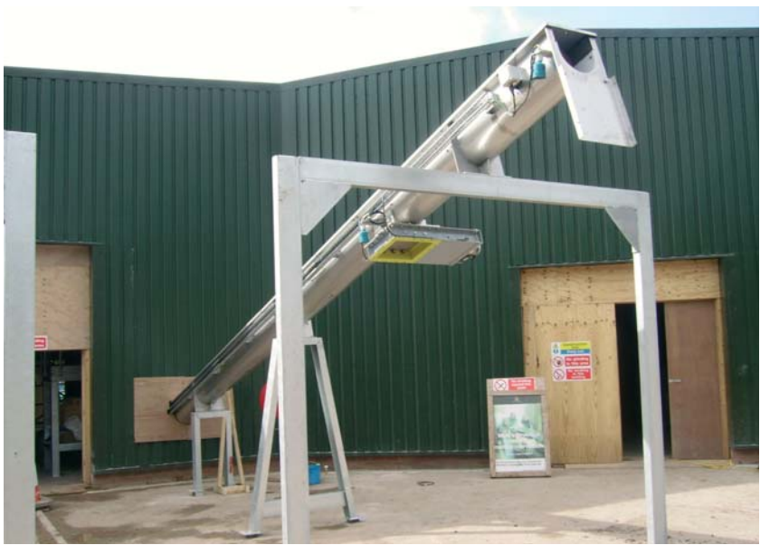
DESIGN, MANUFACTURE & INSTALLATION OF BESPOKE MECHANICAL HANDLING EQUIPMENT.

CTM ARE PROUD TO BE INVOLVED WITH THE SUCCESSFUL IMPLEMENTATION OF THE DEWATERED SLUDGE HANDLING SCHEME AT AXBRIDGE WTW.