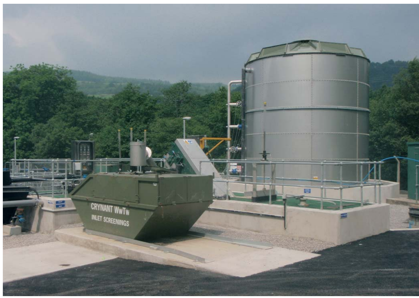
Circular storm tank modified for re-use as Primary Settlement Tank