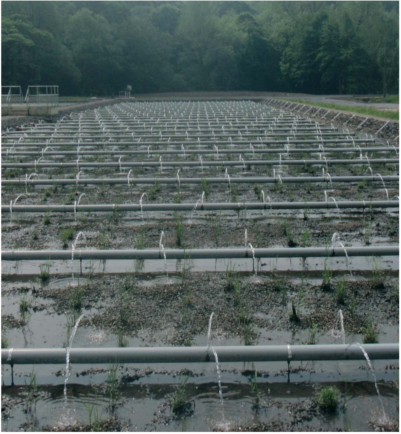
2 No. Reed beds have been provided for effluent polishing

wr Cymru Welsh Water (DCWW) have completed an upgrade of the Waste Water Treatment Works at Crynant to meet a tighter effluent consent standard using a 'low carbon' process solution. Crynant WwTW provides full treatment for all incoming flows up to 90 l/s. The works serves a design population of 5680 PE. The new discharge consent (10mg/l BOD, 15mg/l SS and 5 mg/l AmmN) came into effect on 1st April 2008. The Standard solution for this works discharge upgrade would have been the provision of an energy intensive activated sludge plant followed by sand filtration, including inter-stage pumping. However, in line with DCWW's Sustainable Strategy which includes responding to climate change, a low carbon footprint solution comprising the largest rotating biological contactor RBC and reed bed installation in Wales has been installed.