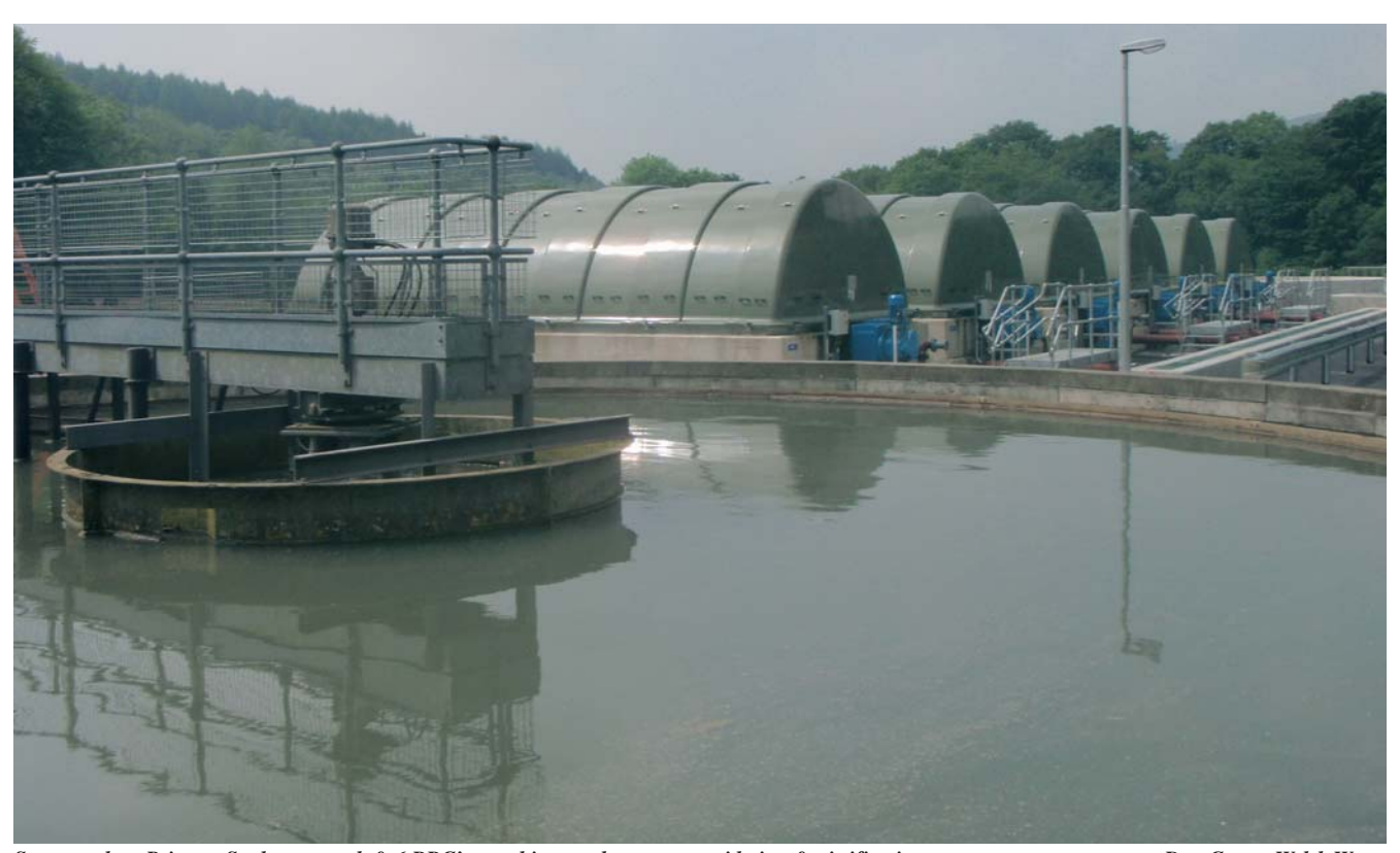
Storm tank as Primary Settlement tank & 6 RBC's to achieve carbonaceous oxidation & nitrification