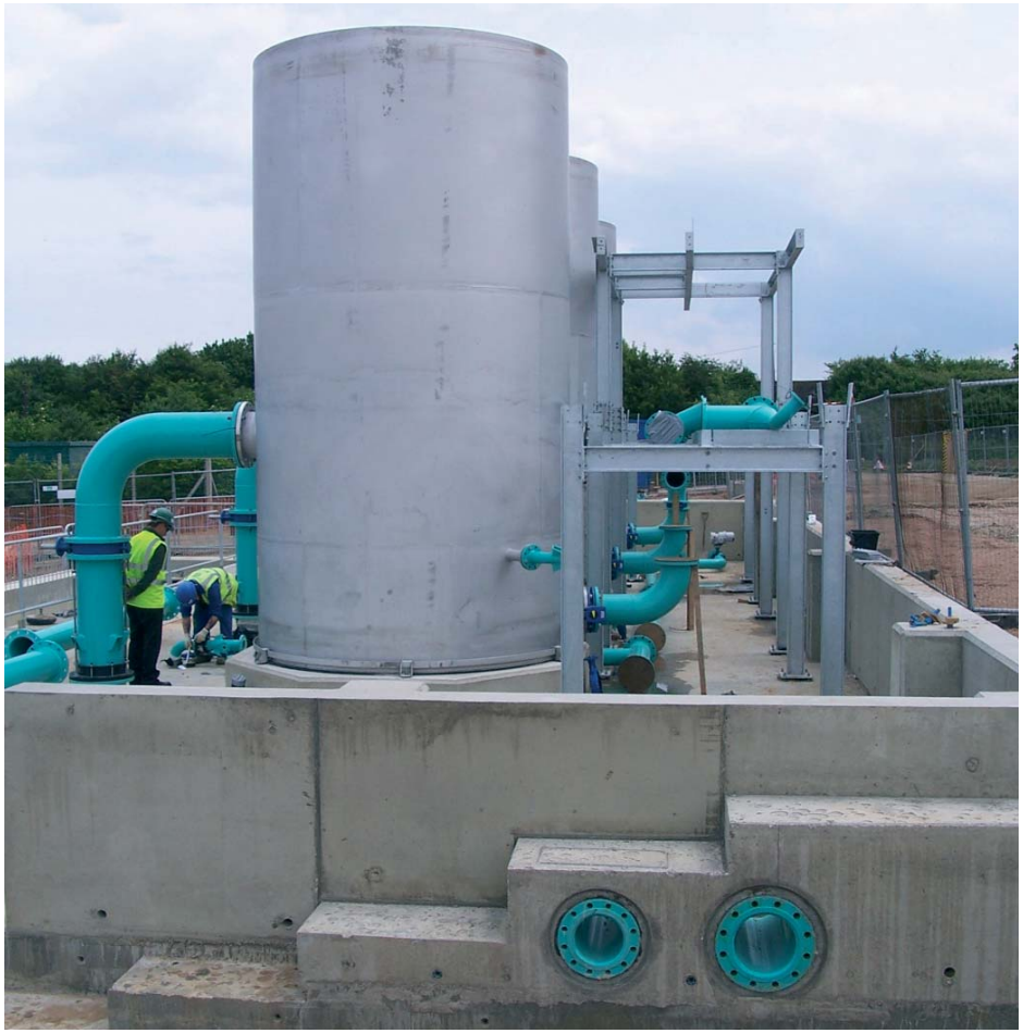
Filter installation at Wighton WTW