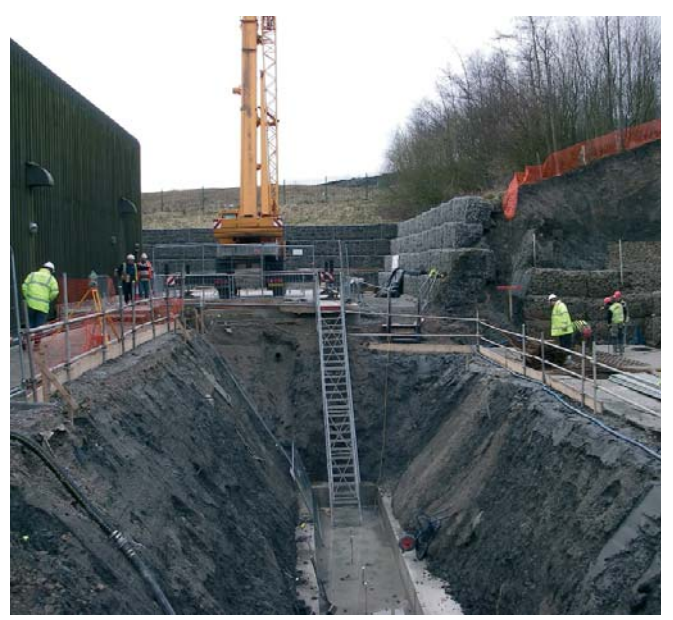
Graincliffe contactors under construction

A key constraint at Graincliffe WTW was the limited amount of space close to the existing inlet works to locate the new MIEX® plant. This is further constrained by the need to maintain chemical and other deliveries to the existing WTW. The MIEX® plant layout has been optimised to provide the best value solution in the available space.