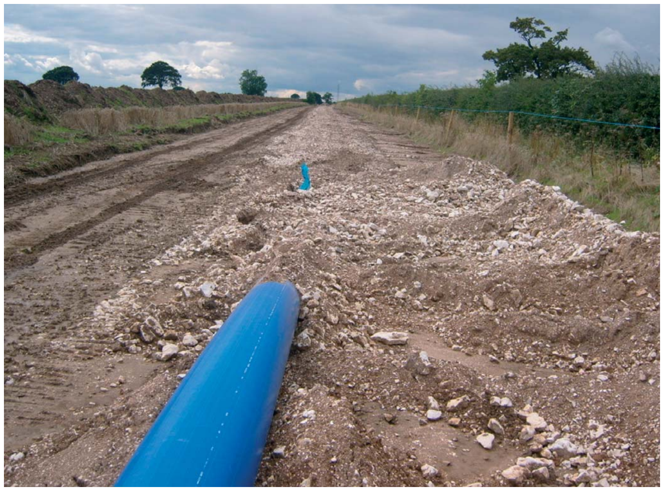
Part of pipeline route now installed by trenching machine

he Irby Reservoir to Caistor Top Reservoir is a £3.4 million link main project located in North Lincolnshire. The main purpose for the construction of the 10km pipeline and associated booster pumping station is to provide security of potable water supply for the Caistor Top supply zone. Irby Reservoir is the main service reservoir for Grimsby and the surrounding areas. The Caistor Top Reservoir serves the town of Caistor and surrounding villages with a population of approximately 9,000. The scheme is located between the towns of Caistor and Laceby in Lincolnshire, approximately 6.5km west from the centre of Grimsby. The area is largely rural in nature and comprises predominantly arable farmland.