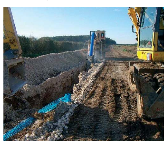
Trencher in action