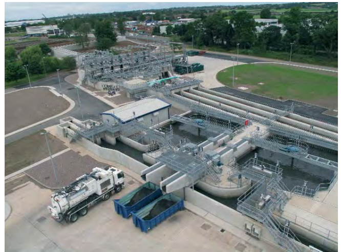
Impressive Grit Removal Performance Courtesy of Bewater North Midland Alliance

Courtesy of Bewater North Midland Alliance