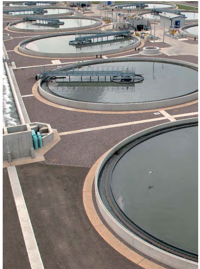
Primary Tank Island and Culverts