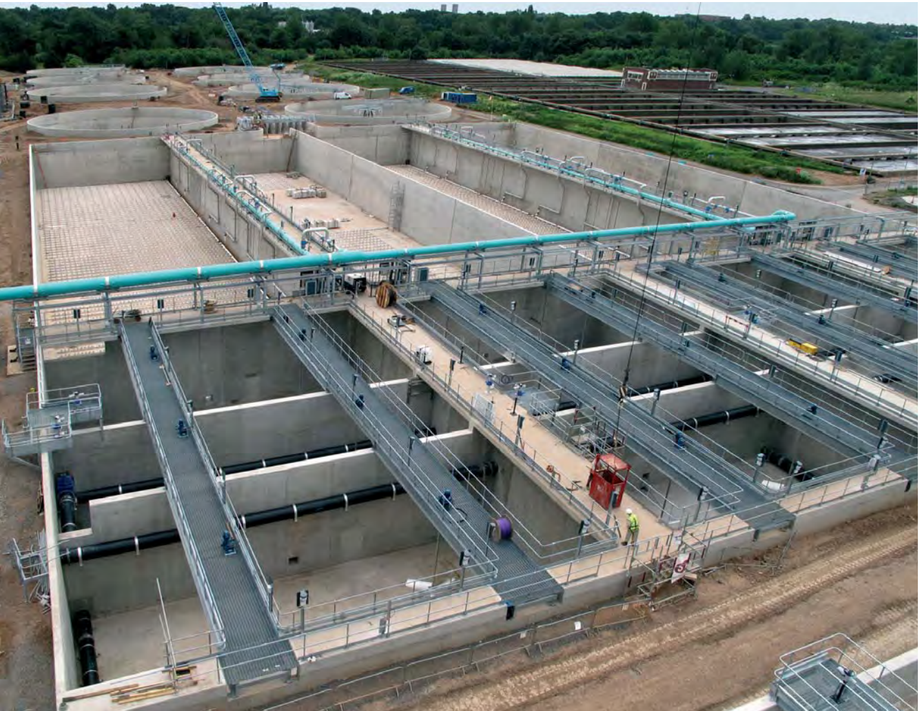
ASP 7 Construction and M&E installation well advanced

deep is complete and M&E installation of the diffusers, air mains, mixers and penstocks is advanced. The tank is configured for the biological nutrient removal process and at 6m water depth is the largest and deepest in Severn Trent delivering optimum oxygen transfer efficiency. The 8 No. Final Settlement tanks at 35.5m diameter represent a good example of challenge to the design manual to save cost and improve layout. Severn Trent's first 3/4 scraper bridges with McKinney baffles have been successfully installed by Tuke & Bell. Phase 2 is forecast to be commissioned 3 months early due to the proactive site team which have driven the supply chain hard and delivered budget savings with initiatives such as the use of Weholite pipelines and pre-fabricated chambers.