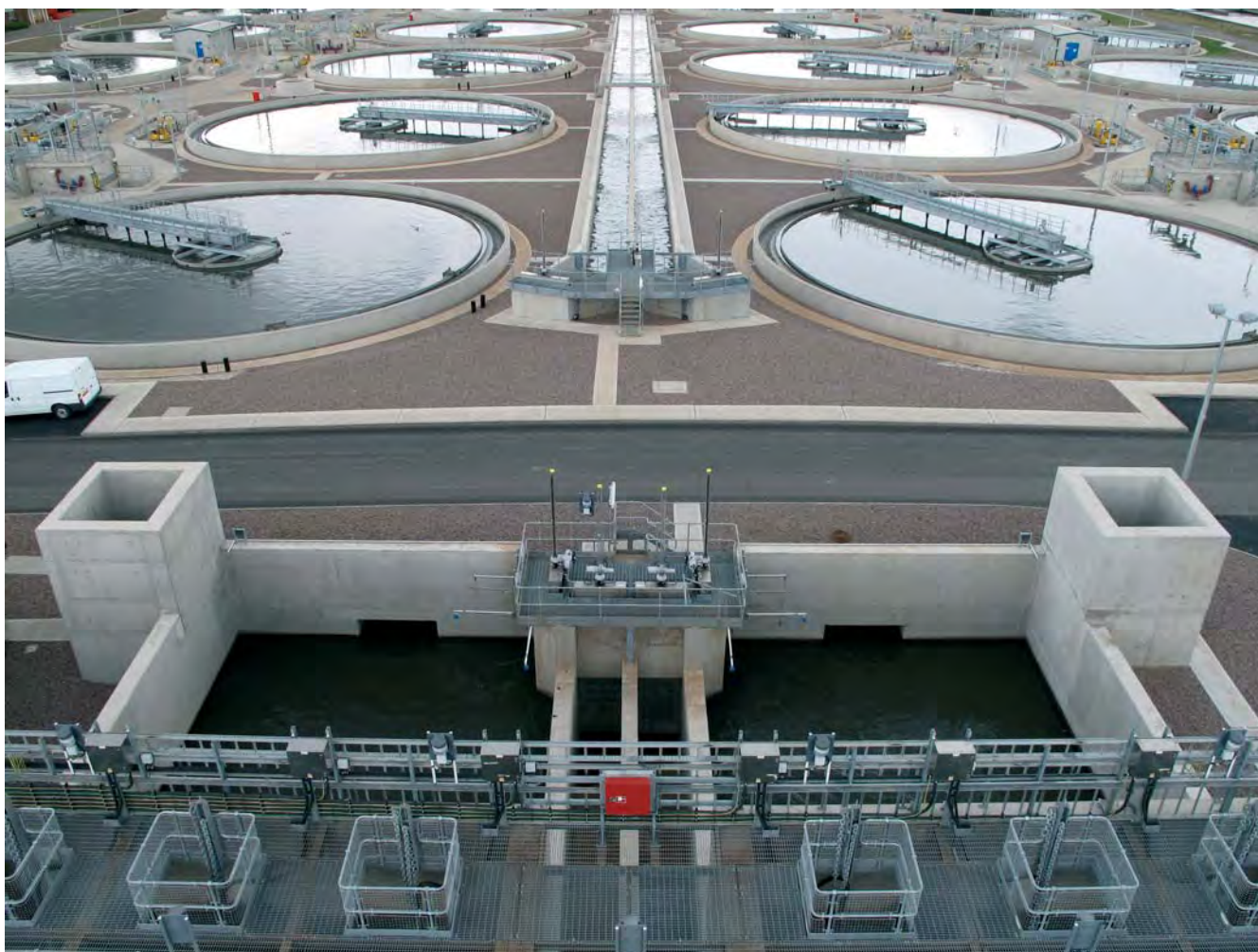
Minworth STW: Settled Sewage Pump Station (front) and Primary Tank Island (rear)

M inworth is Severn Trent's largest Sewage Treatment Works serving a population equivalent of 1.75 million from Birmingham. The plant also treats a high volume of imported sludge from industry and regional works. Average flow is 450 MI/d (5.8 m 3 /s) with full flow to treatment of 1,070 MI/d (12.4 m 3 /s). The UWWD UID requires 61,000 m 3 of additional storm tank capacity which will be achieved by the conversion of existing rectangular primary tanks. A new inlet works and primary tank island has been constructed to improve process performance with the added benefit of increasing the quantity and quality of sludge which will enhance production of renewable energy from the 9MVA generation station. The Fisheries Directive ammonia consent will be reduced from 5 to 3mg/l to improve the quality of the River Tame necessitating upgrade to the existing Activated Sludge Plant 1-6 and provision of an additional ASP 7 configured for the BNR process in preparation for new drivers in AMP5. The scheme also features an extensive programme of capital maintenance of existing assets.