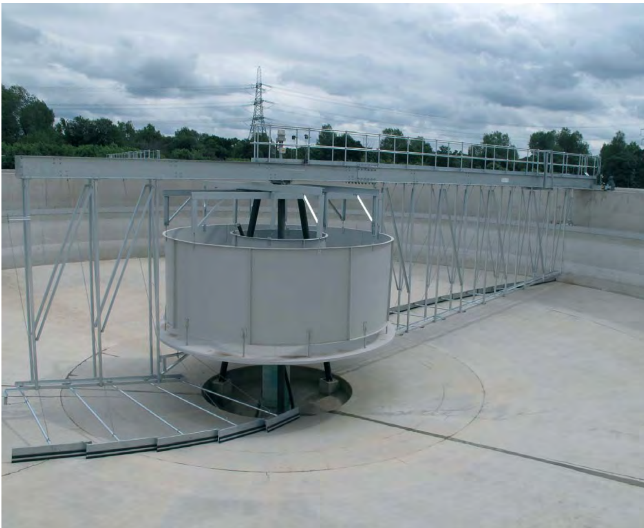
First ¾ Bridge for large diameter FST