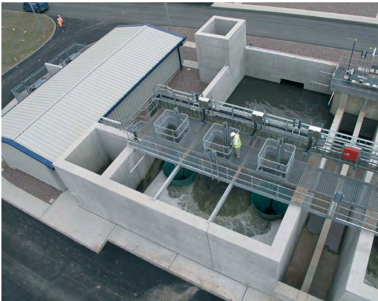
Settled Sewage Pump Station