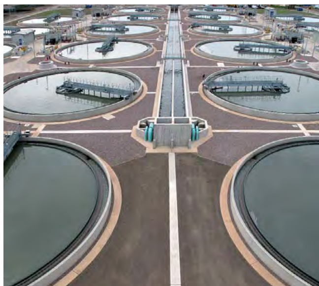
Primary Tank Island and Culverts

The eight lane inlet works is operational with process performance exceeding expectations. The Adams inlet screens (6mm) remove 100 tonnes of screenings per week compared with 30 tonnes at the old works. Spirac made improvements to their screw conveyor drain deck