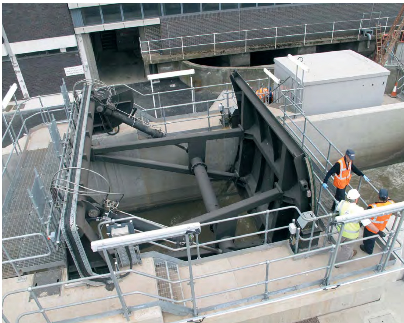
Innovative Radial Gate Flow Control Device

Ecological and Environmental issues have been high on the agenda as the site is classified as a nature conservation area. A woodland area has been planted to maintain wildlife biodiversity and a comprehensive bird study identifying 43 species was issued to the RSPB. The deepest bentonite wall in Europe has been constructed