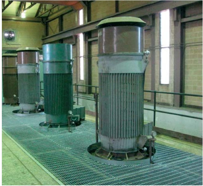
Existing installation (left) and new installation (right)

oor Monkton Raw Water Pump Station (RPS) is a river abstraction pump station located on the River Ouse, north of York, which transfers raw water to Eccup Water Treatment Works (WTW) and reservoir through a dedicated 28km cross-country pipeline. A booster pump station lies approximately half way along the pipe close to Wetherby. Yorkshire Water Services (YWS) commissioned CostainMouchel to replace life-expired and noncompliant High Voltage (HV) switchgear life-expired pump sets at Moor Monkton RPS. The maximisation of the river abstraction licence, up to 142MI/d dependent on river levels (to facilitate Yorkshire Water Services' Water Resources Allocation Plan, WrAP), was also a requirement that necessitated new pumps at Wetherby booster pump station. CostainMouchel's solution provided the lowest whole life cost for the client.