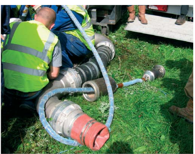
Inversion bag and heater pig