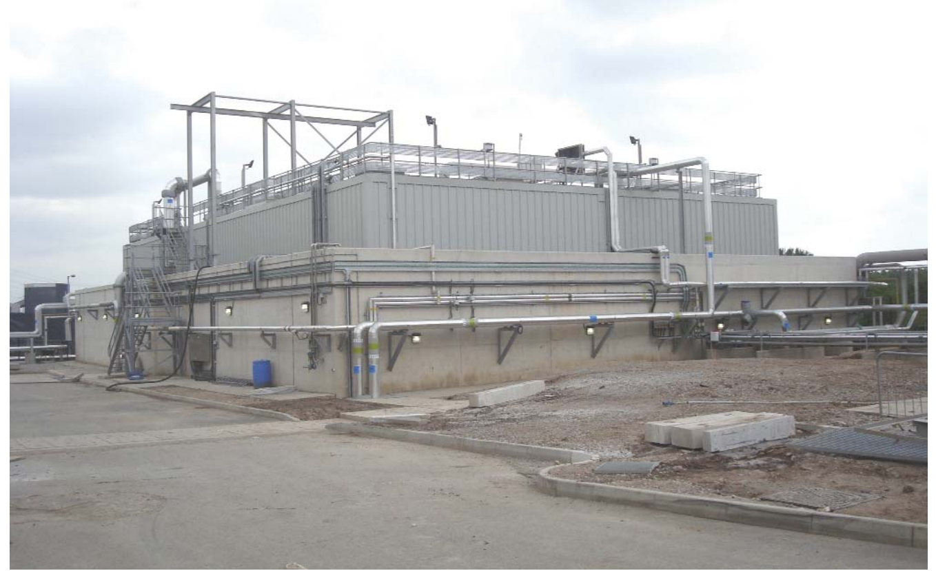
General view of completed plant within concrete bund to meet IPPC requirements (May 2010)

The Mersey Valley Processing Centre (Shell Green) is a strategic digested sludge incineration scheme facility in Widnes on the north bank of the River Mersey. The centre is critical to the safe and efficient disposal of waste water sludge from the Manchester and Liverpool conurbations and was originally constructed in the 1990's. The new Shell Green (Stream 3) extension provides United Utilities with additional capacity by the construction of a new sludge dewatering facility and a third sludge incineration stream. The existing facility receives approximately 65,000 tDS per year of sludge. The Stream 3 extension increases capacity to nearly 90,000 tDS per year serving a population of approximately 4 million.