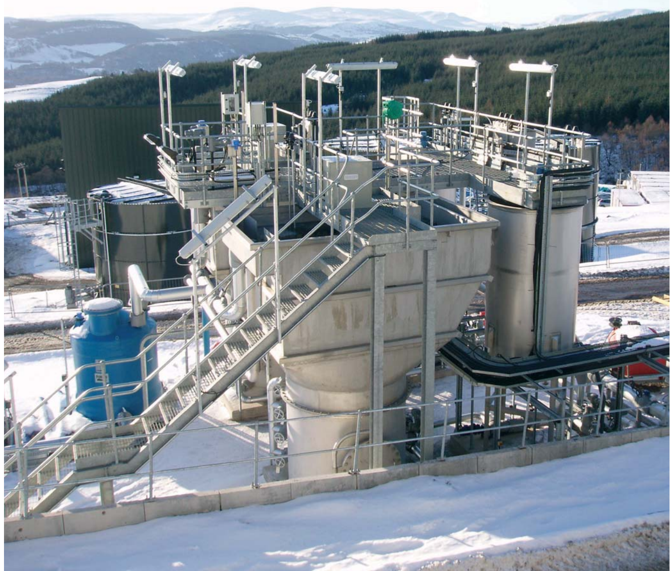
Multiflo Sludge Plant

t 359 metres above sea level, Turret Water Treatment Works (WTW) is the highest in Scotland and sits deep in the picturesque Glen Turret, located approximately 3.5km to the North West of Crieff, a location popular with tourists and hill walkers. Commissioned in 1967, the original WTW serving central Scotland (pe 70,000) comprised of microstrainers and ozone treatment (the first of its kind in Scotland) followed by chlorination. The design included the construction of two hydroelectric generating stations, one at the WTW itself and one further down the valley. With a combined capacity of 1,725 megawatts this was enough to run the entire Plant and allow Scottish Water to sell surplus through the National Grid.