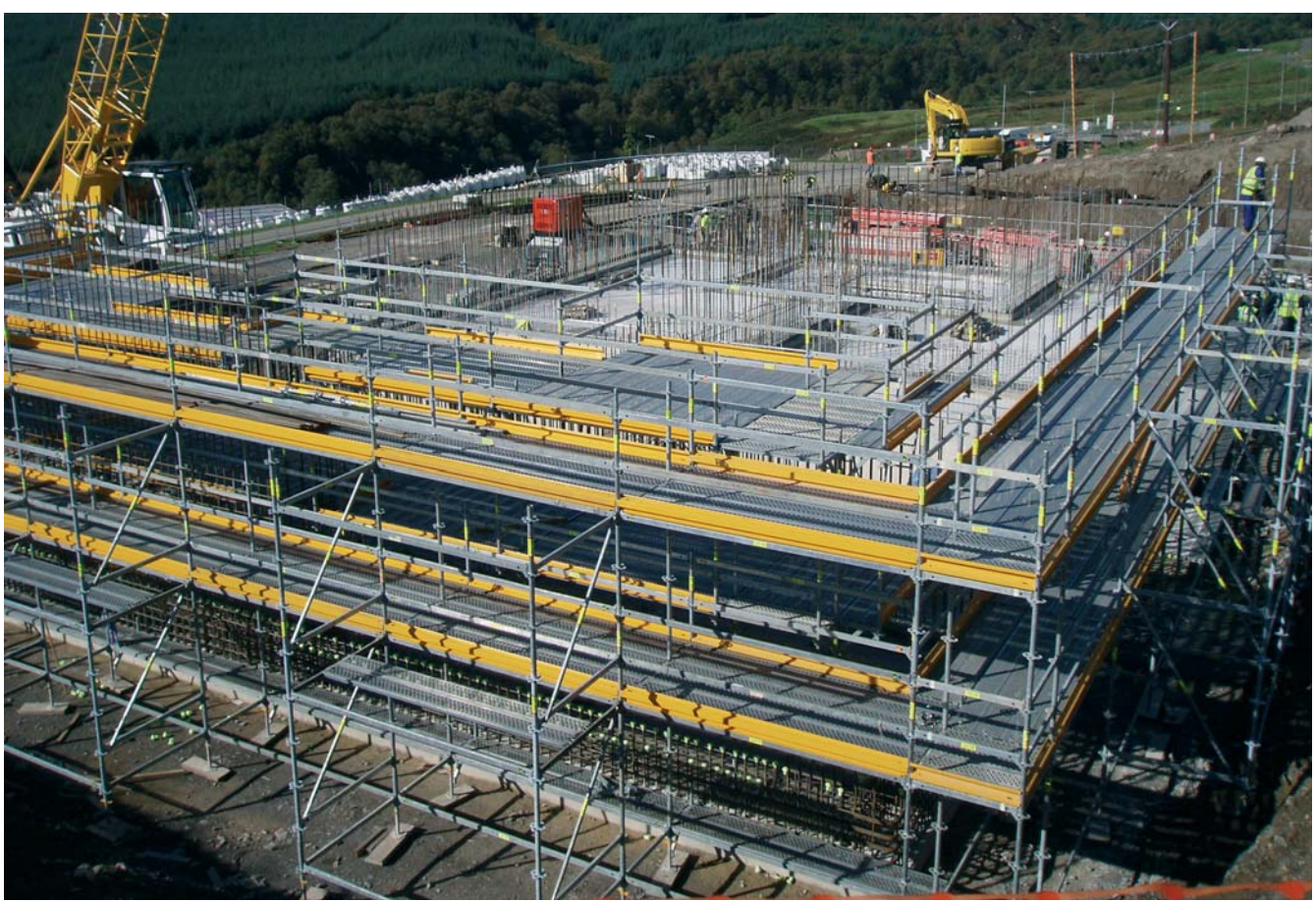
Chlorine Contact Tank