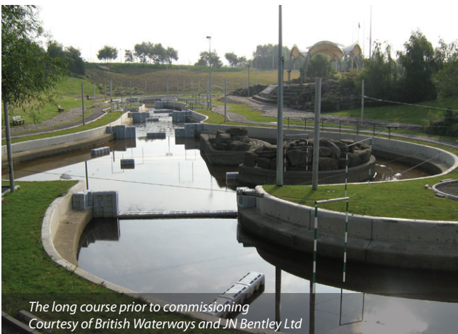
The long course prior to commissioning