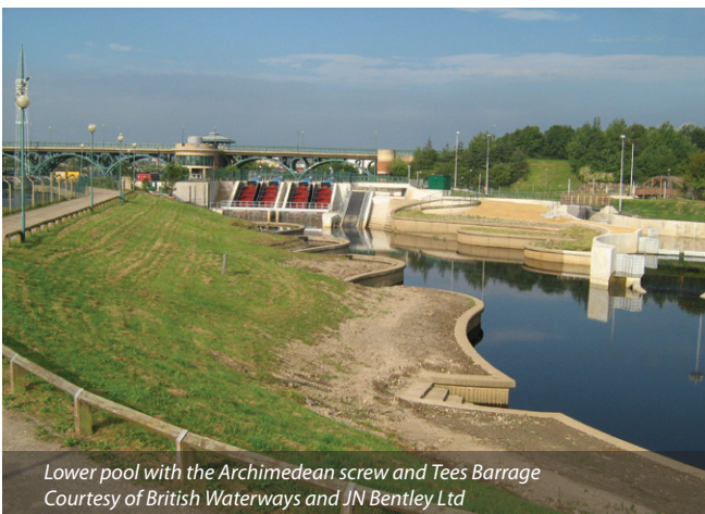
Lower pool with the Archimedean screw and Tees Barrage