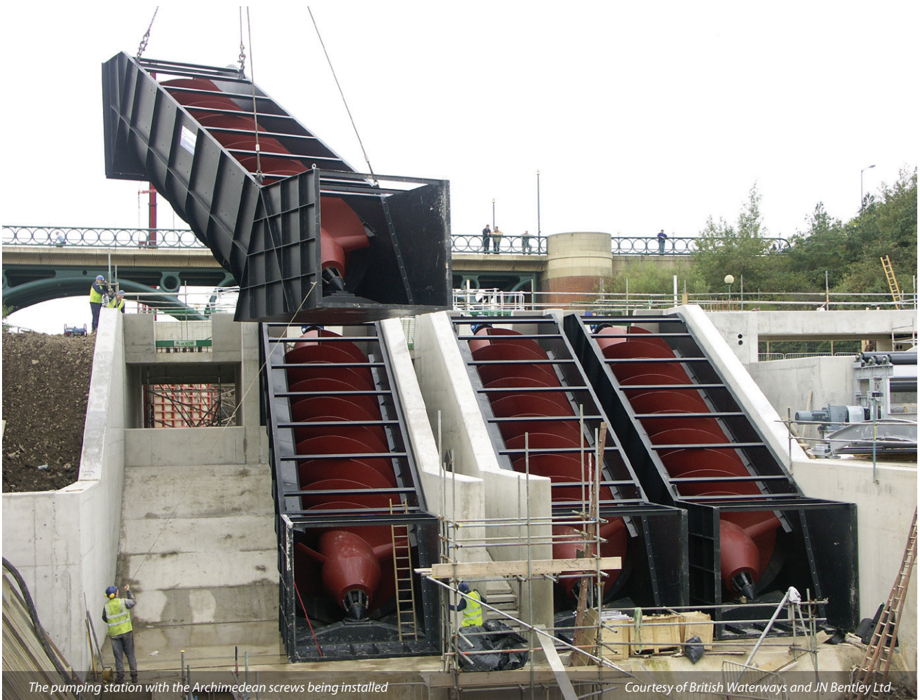
The pumping station with the Archimedean screws being installed

The Tees Barrage White Water Course is located on the north bank of the River Tees adjacent to the Tees Barrage in Stockton on Tees in North East England. The recent £4.6 million redevelopment of the course, funded by regional development agency One North East, Stockton Borough Council, Sport England and British Waterways, has succeeded in creating a world-class white water facility, and the site has already been confirmed as one of the official training camps ahead of the London 2012 Olympic and Paralympic Games. The project is currently the only installation in the world where Archimedean screws are used as both pumps and generators.