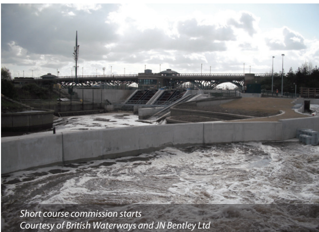
Short course commission starts

Together with the installation of the screws and construction of a new reinforced concrete pumping station, JN Bentley was also tasked with the construction of associated penstocks, stop logs and a fish pass.