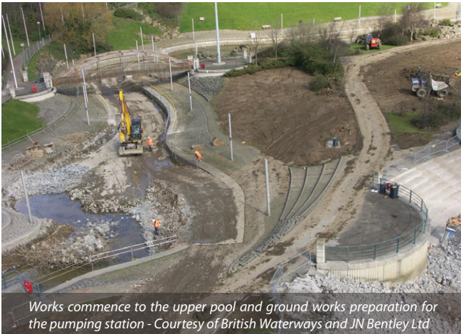
Works commence to the upper pool and ground works preparation for the pumping station