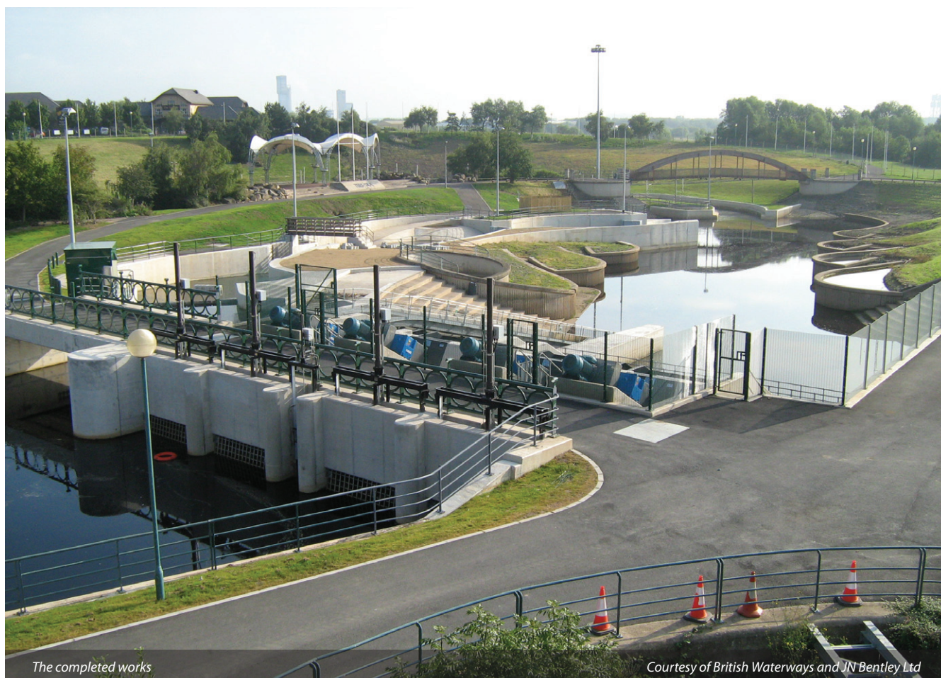
The completed works