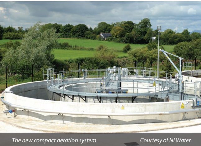
The new compact aeration system