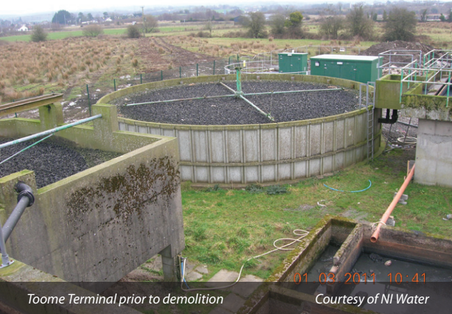
Toome Terminal prior to demolition