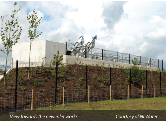
View towards the new inlet works