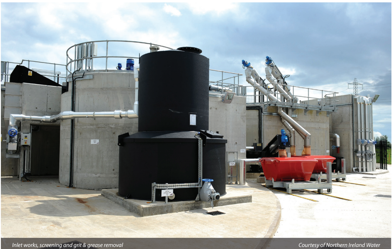
Inlet works, screening and grit & grease removal

Both the Creagh and Toome sites have been landscaped with a belt of native trees and shrubs, mainly deciduous species suited to the