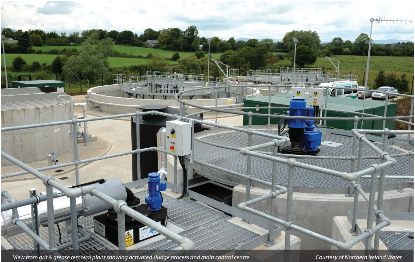
View from grit & grease removal plant showing activated sludge process and main control centre