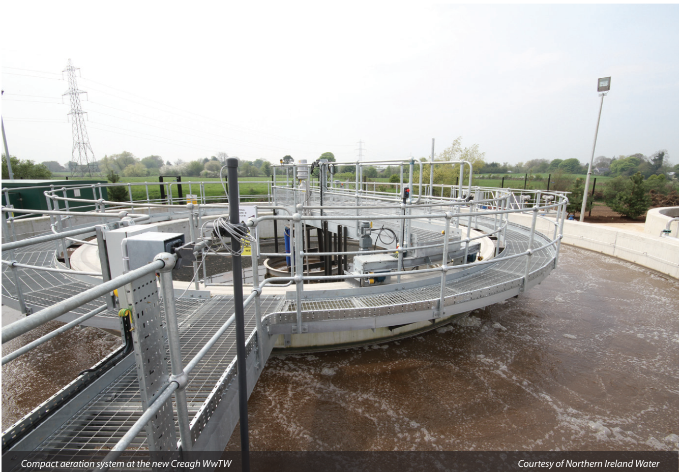
Compact aeration system at the new Creagh WwTW

The villages of Toome and Creagh are situated approximately two miles apart, to the north-west of Lough Neagh, in two different council areas. Until recently the areas were served by two separate wastewater treatment works (WwTW): Toome WwTW and Creagh WwTW. Northern Ireland Water, as part of its extensive investment programme to upgrade the wastewater systems across Northern Ireland, has just completed a major £5m package of improvement works in the Toome and Creagh areas. Forward thinking and rationalisation in design saw NI Water and its project team develop an optimum combined solution to deliver a modern treatment system for the two areas, which would bring about significant environmental benefits for the wider Toome/Creagh catchment.