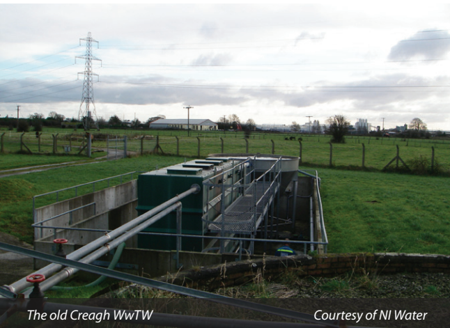
The old Creagh WwTW