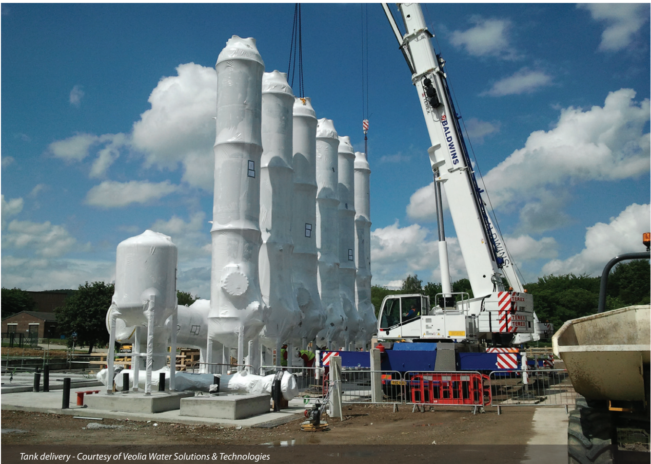
Tank delivery - Courtesy of Veolia Water Solutions & Technologies

Since the thermal hydrolysis process is new to Yorkshire Water, Veolia recognise that enhanced levels of operational and process