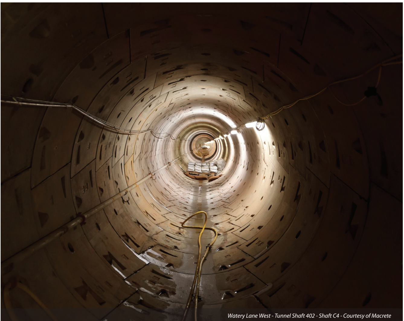
Watery Lane West - Tunnel Shaft 402 - Shaft C4

United Utilities has invested £49m addressing 32 unsatisfactory intermittent discharges (UIDs) in Preston to both improve the Fylde Coast bathing waters and to protect shellfish beds. Clifton March WwTW treats waste from six sub-catchments. The Fairhaven, Lytham and Freckleton catchments are located to the west of Clifton Marsh WwTW, within the Fylde district. The Lea Gate and Watery Lane catchments are located predominantly within the borough of Preston, and Penwortham is located to the south of the River Ribble, within the South Ribble council boundary. The UIDs are spread across four of the six sub-catchments (Freckleton, Lea Gate, Watery Lane and Penwortham). There were no UIDs identified in the remaining two WwTW sub-catchments, Fairhaven and Lytham in this Asset Management Period.