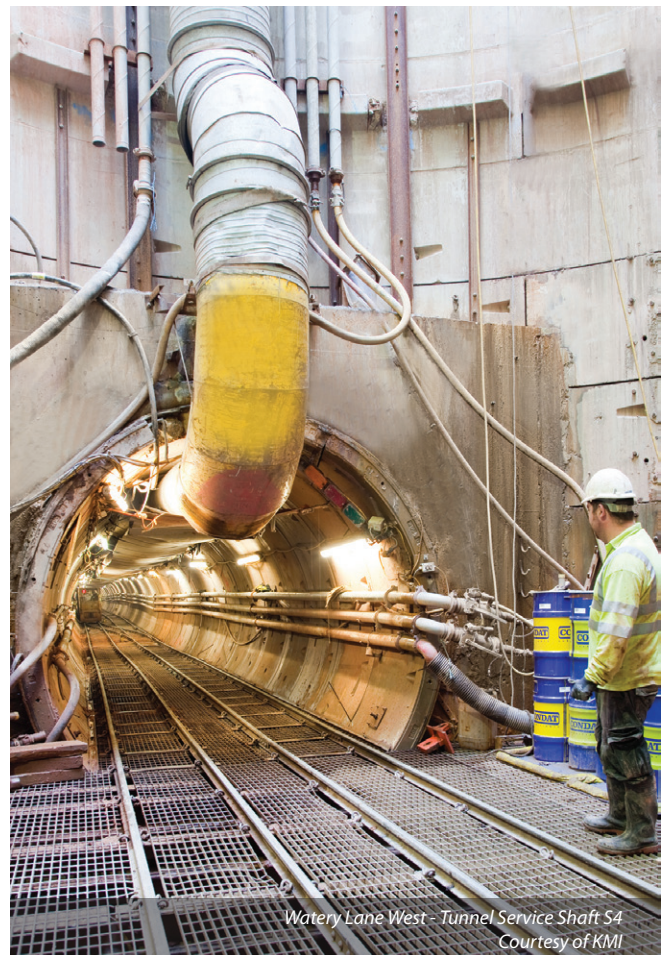
Watery Lane West - Tunnel Service Shaft S4