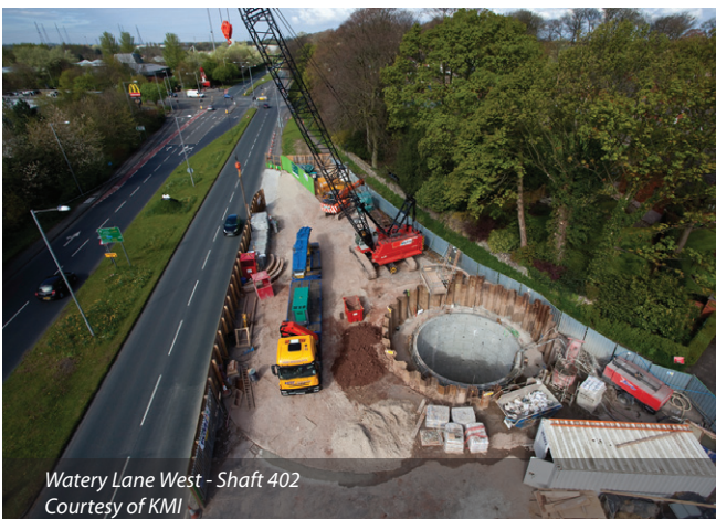
Watery Lane West - Shaft 402