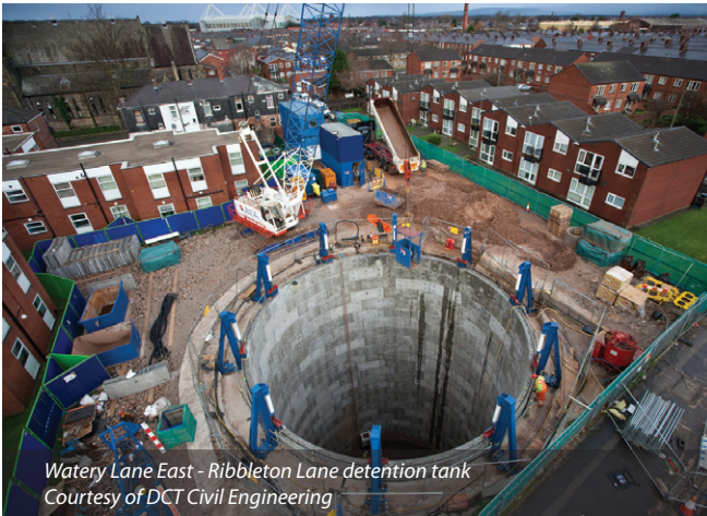
Watery Lane East - Ribbleton Lane detention tank