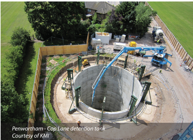
Penwortham - Cop Lane detention tank