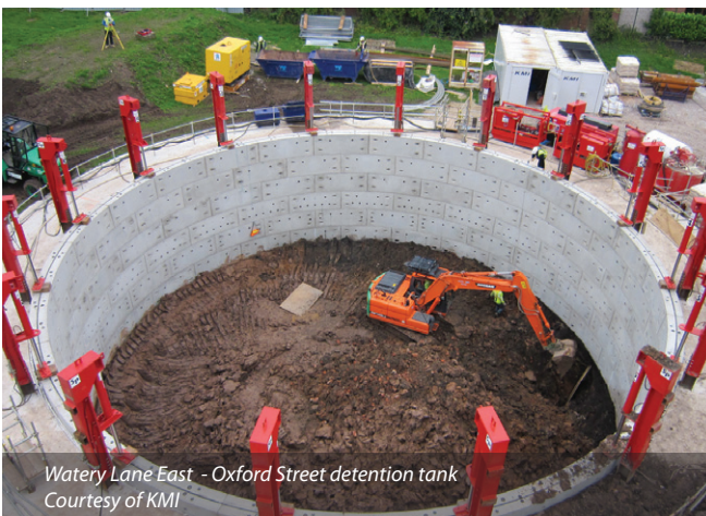
Watery Lane East - Oxford Street detention tank