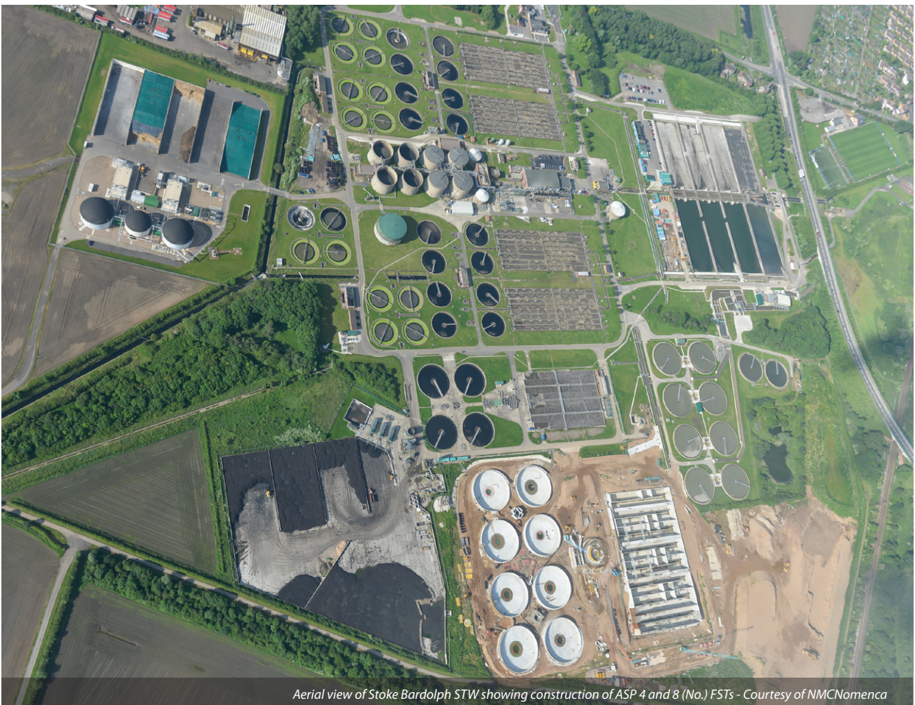
Aerial view of Stoke Bardolph STW showing construction of ASP 4 and 8 (No.) FSTs

Stoke Bardolph STW serves the majority of the Nottingham catchment and is located adjacent to the River Trent east of the city. The works has suffered from intermittent ammonia and sanitary limit failures and a new P removal consent will be in place from September 2014. A strategic decision for a "Blue Skies" approach was taken by the Severn Trent Water (STW)/NMCNomenca team to look at the need to meet the future phosphorus consent through a holistic investment appraisal, rather than the traditional narrow focus approach given to such projects. The review incorporated the closure of smaller works in the vicinity and the transfer of flows to improve operational efficiency. The design has also ensured the works can be extended to accommodate future population growth for the next 20 years.