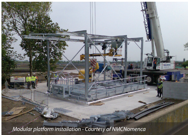
Modular platform installation

The following initiatives form an integral part of the scheme: