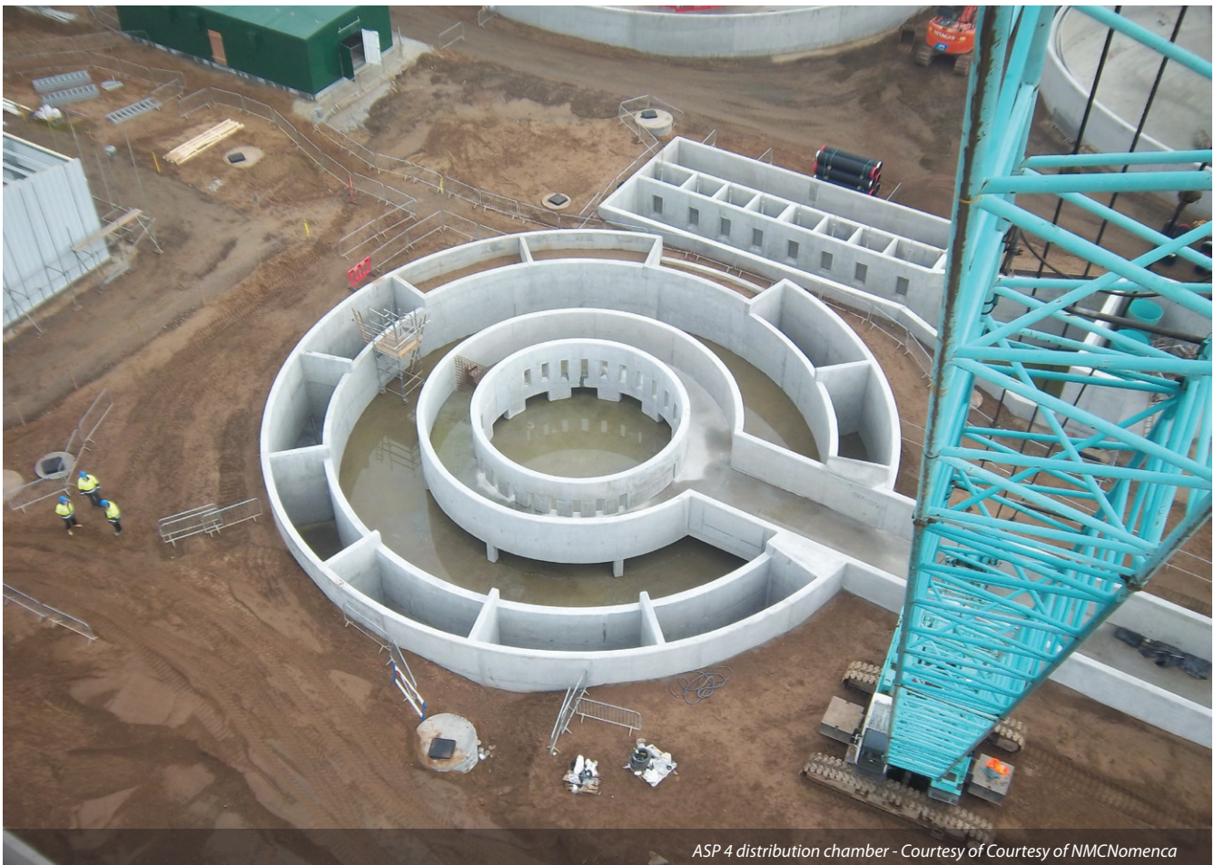
ASP 4 distribution chamber

3D modelling was used on the scheme to increase design efficiency, reduce the need for redesign and facilitated end user to 'buy-into' to the proposed solutions more easily. Working with the key supply chain partners the solution was developed to ensure full compliance with the CDM Regulations through the construction, operation, maintenance and demolition of the works.