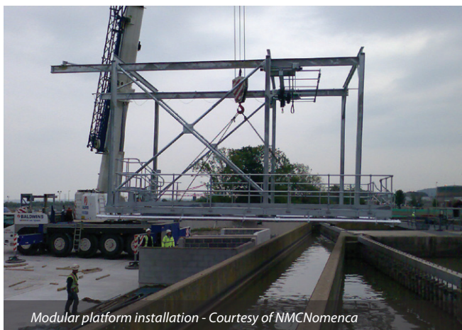
Modular platform installation