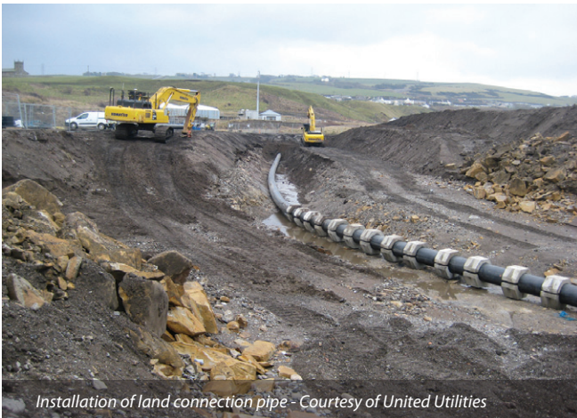
Installation of land connection pipe