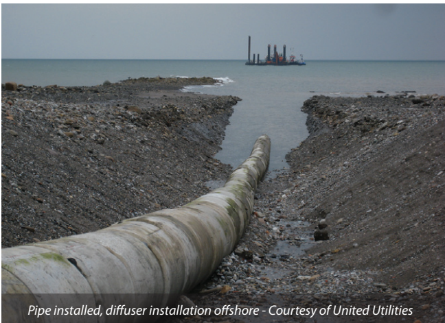
Pipe installed, diffuser installation offshore