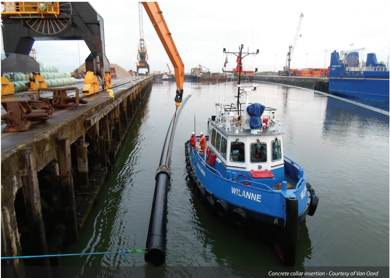
Concrete collar insertion

The authors thank United Utilities, Van Oord and Pipelife Norge AS for their assistance with this paper.