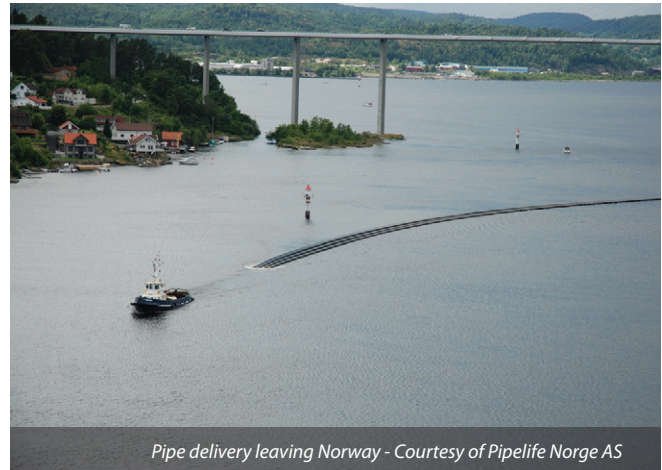
Pipe delivery leaving Norway - Courtesy of Pipelife Norge AS

Due to the location of the railway line between the treatment works and the beach, the only existing access to the beach was via a narrow underpass with a height restriction of 1.8m. Due to its designation, access through Lowca Beck was also prohibited and hence a constraint was imposed requiring all plant, machinery and materials required for the beach works to be transported via marine access. In addition, the works were undertaken with consent from the Marine Management Organisation.