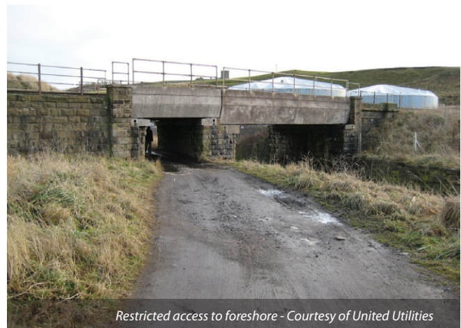
Restricted access to foreshore