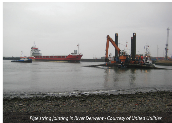
Pipe string jointing in River Derwent