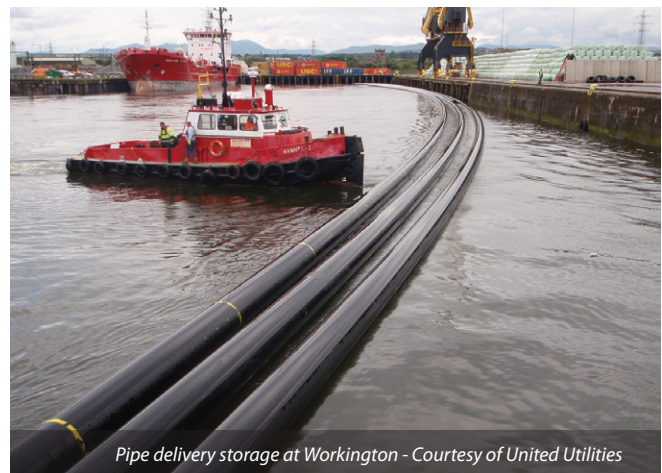
Pipe delivery storage at Workington