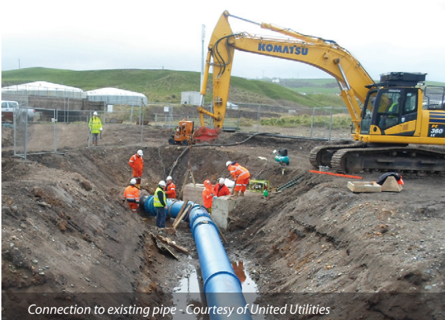
Connection to existing pipe - Courtesy of United Utilities