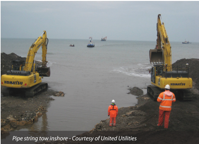
Pipe string tow inshore