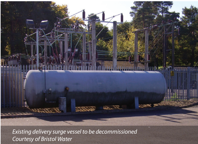
Existing delivery surge vessel to be decommissioned