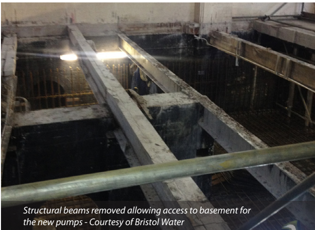
Structural beams removed allowing access to basement for the new pumps