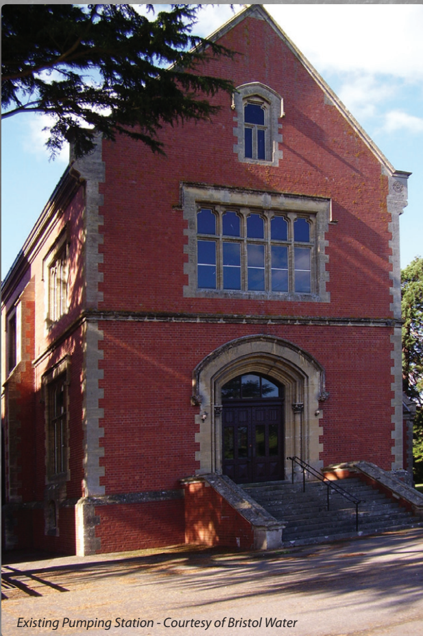
Existing Pumping Station

The Blagdon Reservoir is surrounded by the picturesque Mendip Hills, an Area of Outstanding Natural Beauty (AONB). The lake covers over 200 hectares and its long narrow shape with plenty of points and promontories has made it renowned among anglers for the trout fishing. The lake was built at the turn of the last century (1902) to supply water to Bristol and the surrounding area and is classified as a Site of Special Scientific Interest (SSSI) by Natural England for its wildflower meadows and native bird population. The reservoir is key to Bristol's water supply; its location 16km south of Bristol allows it to supply several different treatment facilities, ensuring resilience to the Bristol Network. Each year the pumping station supplies approximately 13,000ML of raw water to the southern treatment plants, which in turn helps supply Bristol Water's 1.1 million customers.