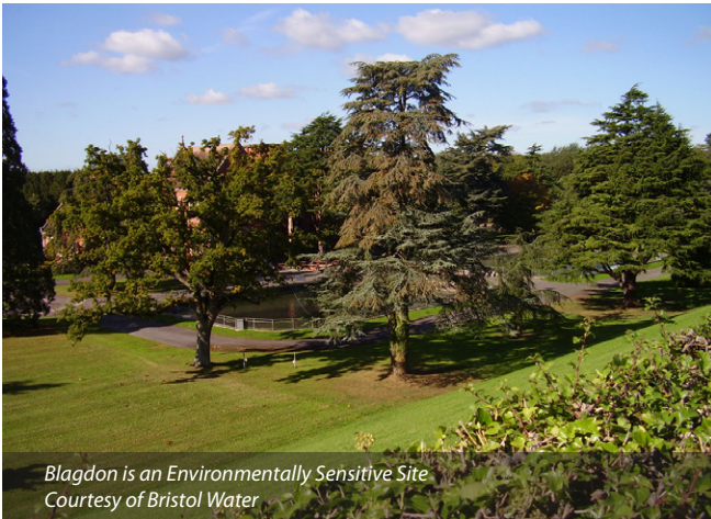
Blagdon is an Environmentally Sensitive Site