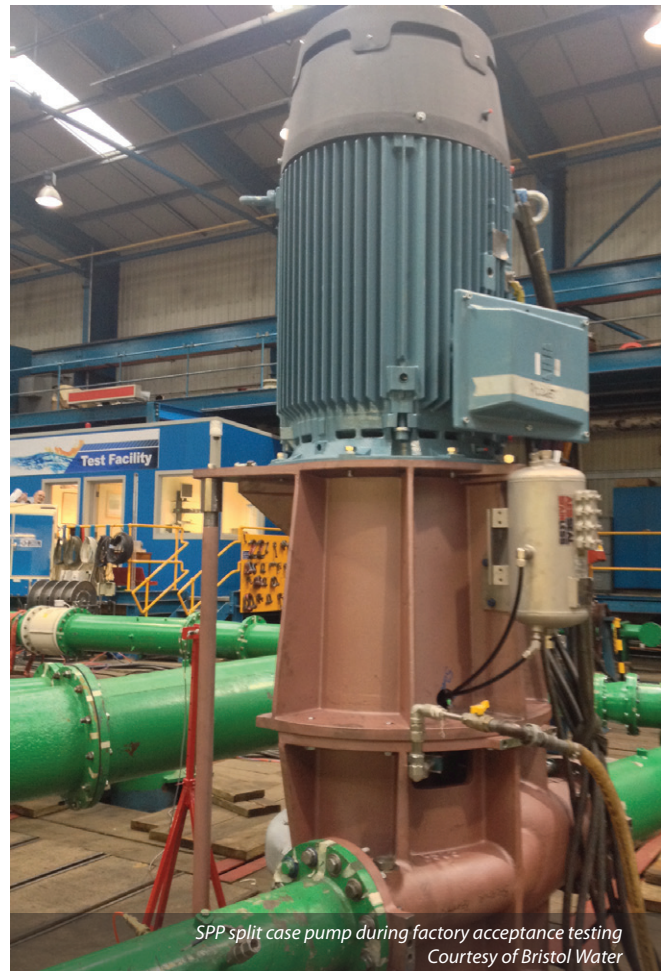
SPP split case pump during factory acceptance testing

Within AMP6 there is scope to replace the tunnel with a draw off tower. This makes operation of the new siphon system at the lowest water levels in the reservoir imperative to the operation during its construction phase.