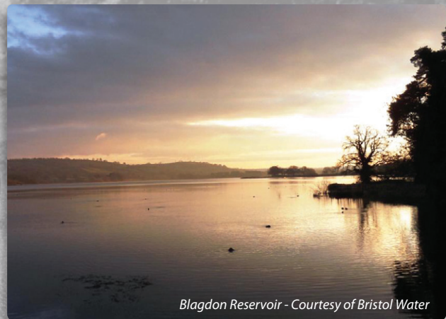
Blagdon Reservoir