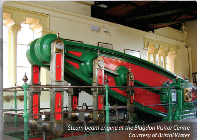
Steam beam engine at the Blagdon Visitor Centre