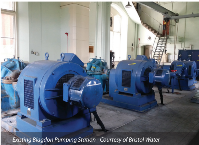
Existing Blagdon Pumping Station