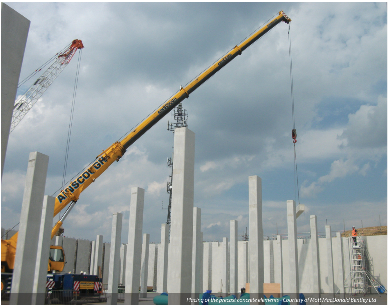
Placing of the precast concrete elements

B ramley Service Reservoir (SRE) is owned and operated by Yorkshire Water Services (YWS), delivering a constant clean water supply to the large catchment area of Leeds, West Yorkshire. The two existing service reservoirs were constructed in 1880 and 1912 respectively and were reaching the end of their designed asset lifespan. A new £3.8m twin compartment service reservoir with a 16ML capacity was therefore required to maintain the critical link in the clean water distribution network for the surrounding catchment area.