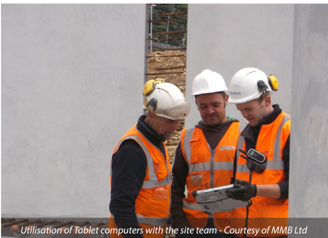
Utilisation of Tablet computers with the site team - Courtesy of MMB Ltd