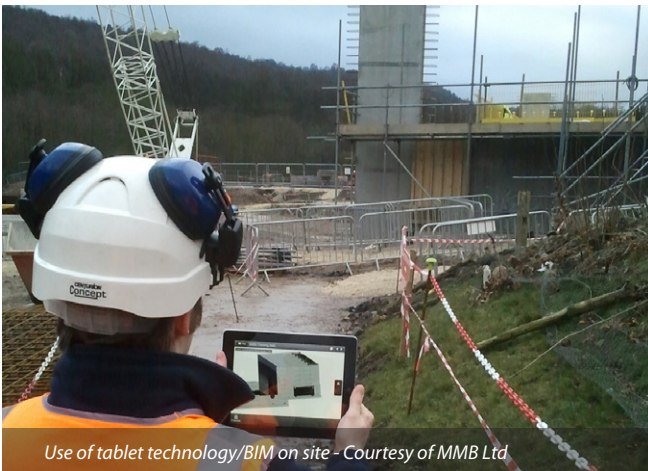
Use of tablet technology/BIM on site