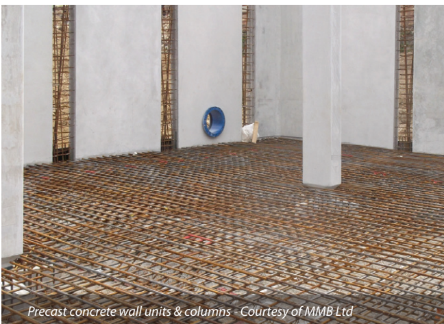
Precast concrete wall units & columns