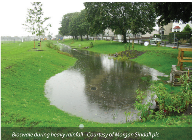
Bioswale during heavy rainfall