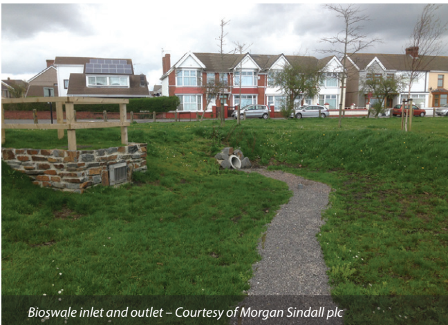
Bioswale inlet and outlet