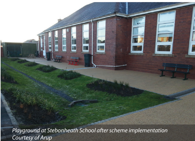
Playground at Stebonheath School after scheme implementation