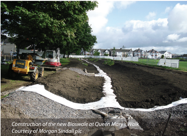
Construction of the new Bioswale at Queen Mary's Walk