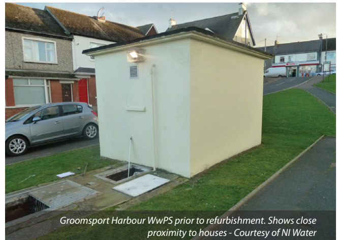
Groomsport Harbour WwPS prior to refurbishment. Shows close proximity to houses