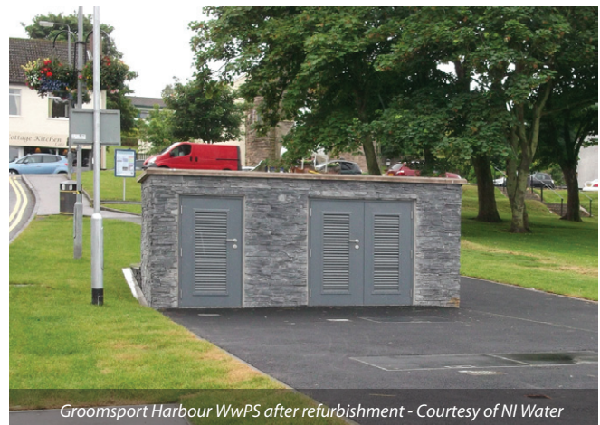
Groomsport Harbour WwPS after refurbishment