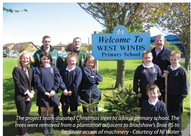
The project team donated Christmas trees to a local primary school. The trees were removed from a plantation adjacent to Bradshaw's Brae PS to facilitate access of machinery