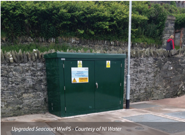
Upgraded Seacourt WwPS