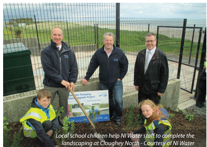
Local school children help NI Water staff to complete the landscaping at Cloughey North