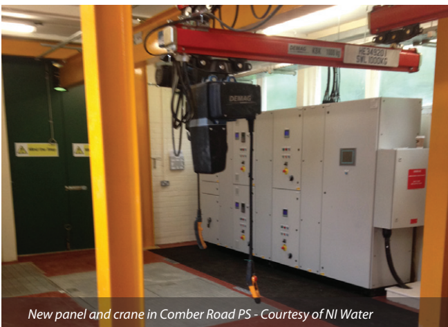
New panel and crane in Comber Road PS