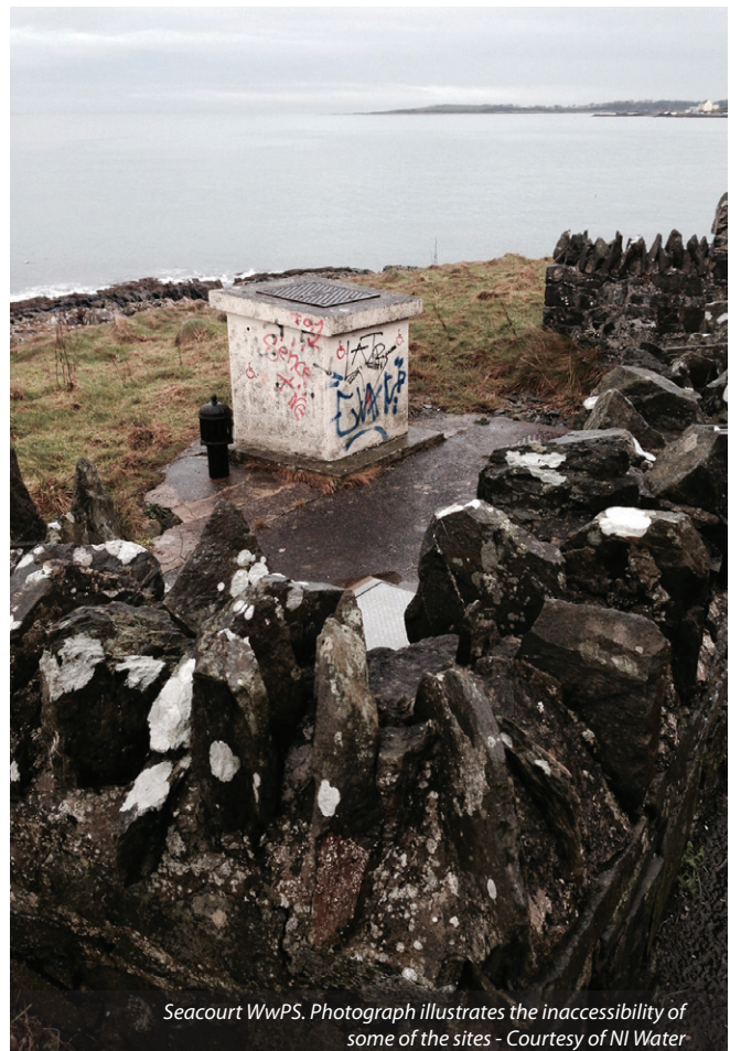
Seacourt WwPS. Photograph illustrates the inaccessibility of some of the sites

In a bid to constantly improve the entire construction and commissioning process, 'Construction Meets Design' sessions were held on site to review issues and carry forward lessons learned to the next sets of designs.