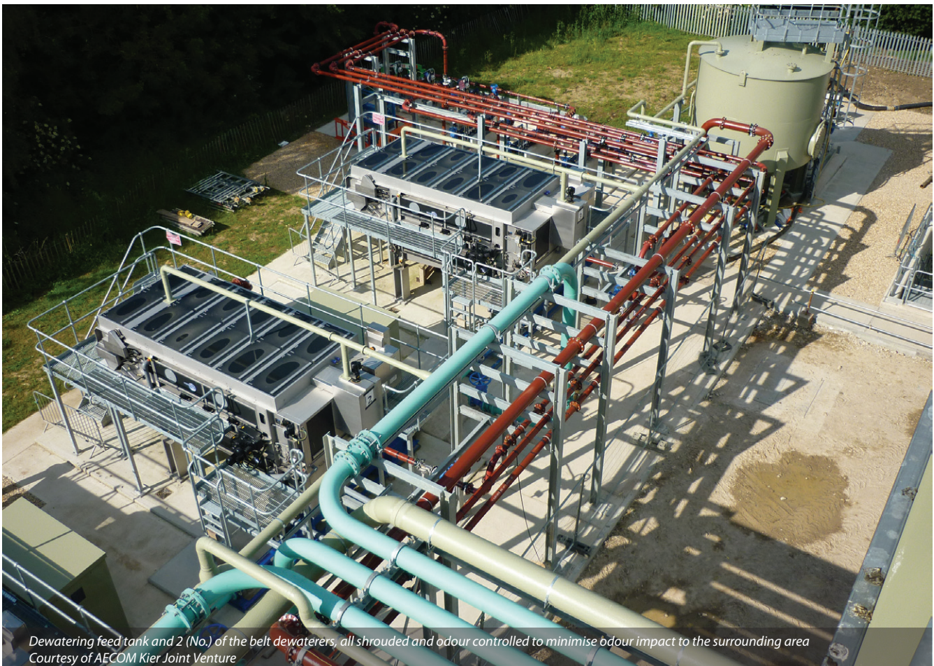
Dewatering feed tank and 2 (No.) of the belt dewaterers, all shrouded and odour controlled to minimise odour impact to the surrounding area

Anaerobic digesters: Each pair of the 4 (No.) digesters has 2 (No.) duty/standby recirculation pumps. These pumps operate continuously, whilst automatically actuated valves are used to alternate the recirculation between the digesters in each pair on an adjustable timed basis. The recirculation pipework runs from each pair of digesters to a point adjacent to the THP plant, where the