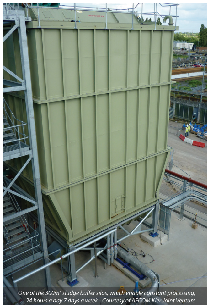
One of the 300m 3 sludge buffer silos, which enable constant processing, 24 hours a day 7 days a week - Courtesy of AECOM Kier Joint Venture