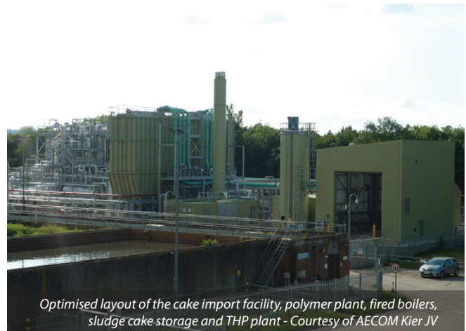
Optimised layout of the cake import facility, polymer plant, fired boilers, sludge cake storage and THP plant

Pre-THP sludge dewatering: The blended sludge will be pumped across the site from the blended sludge tank(s) to the dewatering feed tank. Liquid sludges from this tank are fed to the three belt dewaterers, and also used for re-wetting the imported cake as necessary. Cake from the dewaterers is transferred to the THP feed silos by a dedicated cake discharge pump at each dewaterer.