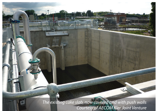
The existing cake slab, now covered and with push walls