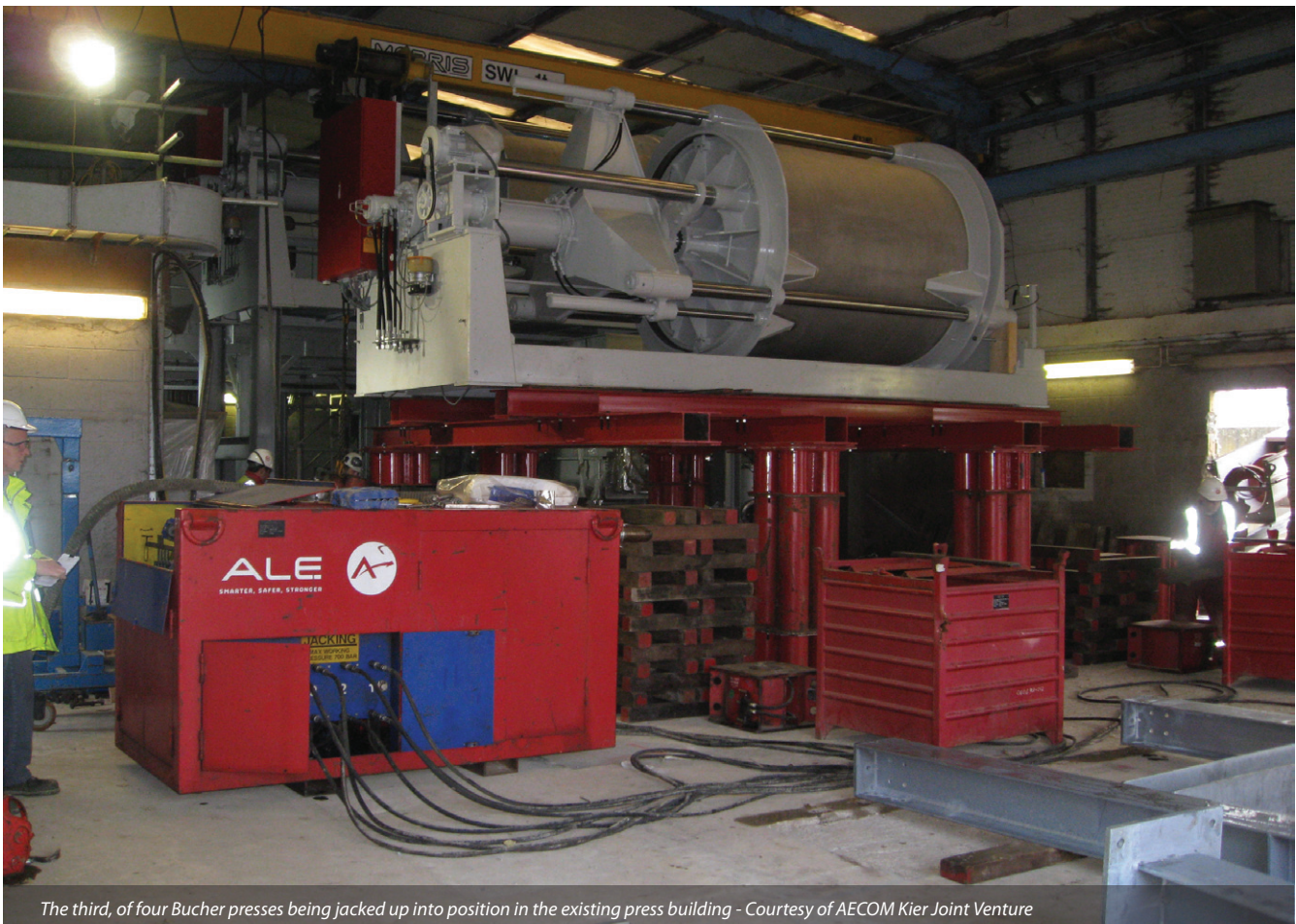
The third, of four Bucher presses being jacked up into position in the existing press building