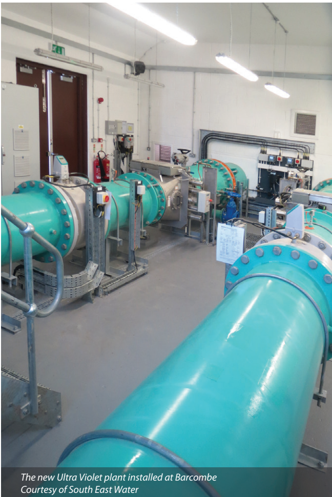
The new Ultra Violet plant installed at Barcombe