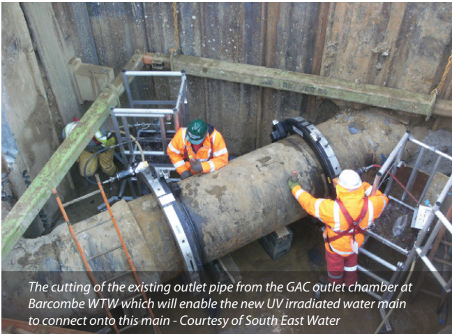
The cutting of the existing outlet pipe from the GAC outlet chamber at Barcombe WTW which will enable the new UV irradiated water main to connect onto this main

In addition to this, it was a requirement to feed water through the two UV reactors under gravity, thereby eliminating the need for costly relief pumping which would have been difficult to construct alongside the UV building. In order to achieve this, the pipe diameters, before and after the UV building, were increased from the proposed 900mm to 1,200mm.