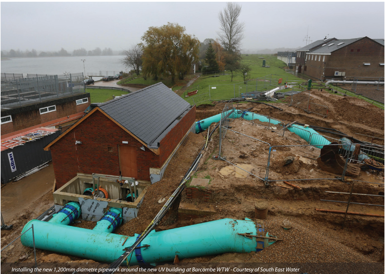
Installing the new 1,200mm diameter pipework around the new UV building at Barcombe WTW

With this contract in place, Interserve set about the design phase and with the procurement phase underway construction of the building began in earnest early autumn 2013.