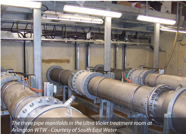
The three pipe manifolds in the Ultra Violet treatment room at Arlington WTW