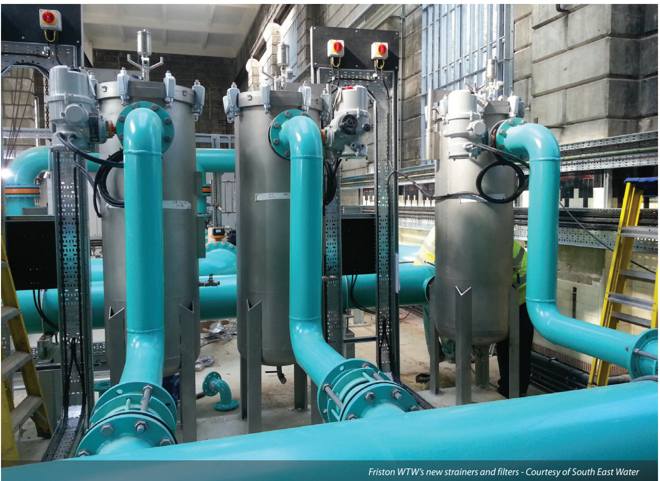
Friston WTW's new strainers and filters

South East Water's delivery programme for year four of AMP5 required that five water treatment works needed to have a UV facility installed and made operational by the 31 March 2014 in order to comply with the Drinking Water Inspectorate's regulatory requirements for the inactivation of cryptosporidium. Once achieved, and with the successful delivery of four similar requirements over the previous years, nine out of the 10 water treatment works sites would have been completed with the final upgrade due by 31 March 2015. During the course of that year, the delivery contractor, Interserve, was asked to mobilise site teams at each of the five treatment works and proceeded to implement the different stages of design, procurement, installation, testing and commissioning concurrently in order to secure each upgrade without adversely affecting any of the others. This article details the work undertaken at Barcombe, Crowhurst Bridge, Greywell, Arlington and Friston WTWs.