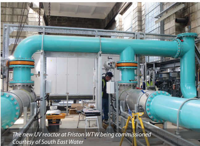
The new UV reactor at Friston WTW being commissioned

rapid gravity filtration (RGF), pesticide removal by ozone, taste and odour control by granulated activated carbon (GAC) filters and disinfection. Treated water is then pumped into supply.