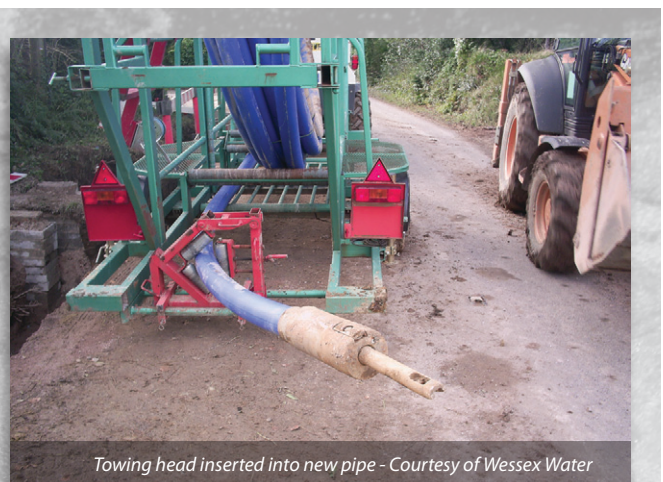
Towing head inserted into new pipe