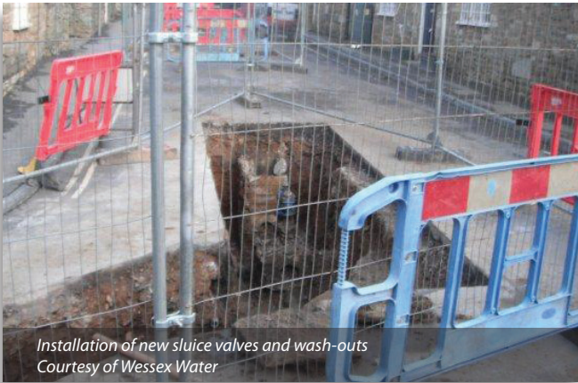
Installation of new sluice valves and wash-outs