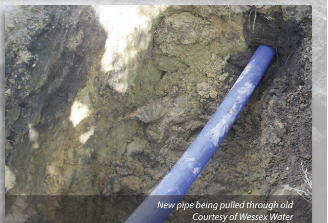
New pipe being pulled through old