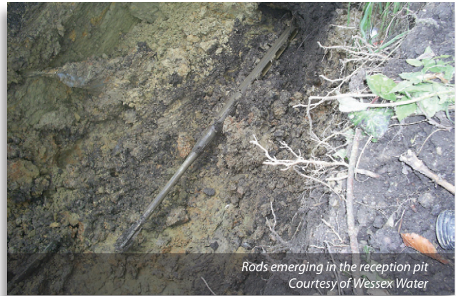
Rods emerging in the reception pit

Transport to provide a bus shuttle service through the village for the duration of the scheme.