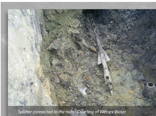
Splitter connected to the rods