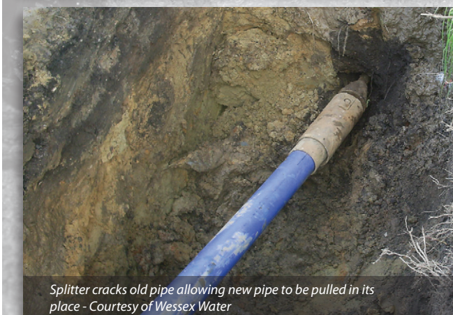
Splitter cracks old pipe allowing new pipe to be pulled in its place