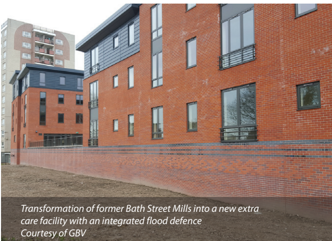
Transformation of former Bath Street Mills into a new extra care facility with an integrated flood defence