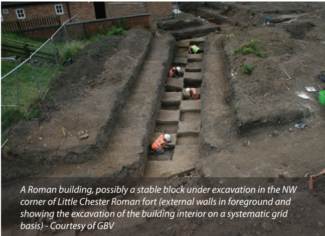
A Roman building, possibly a stable block under excavation in the NW corner of Little Chester Roman fort (external walls in foreground and showing the excavation of the building interior on a systematic grid basis)