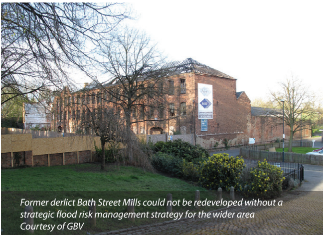
Former derelict Bath Street Mills could not be redeveloped without a strategic flood risk management strategy for the wider area