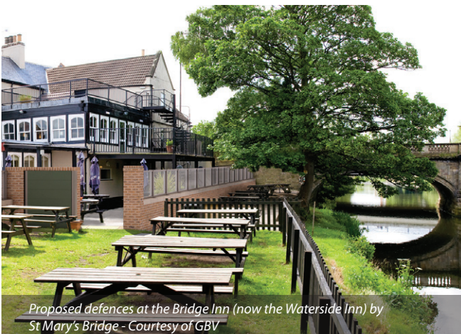
Proposed defences at the Bridge Inn (now the Waterside Inn) by St Mary's Bridge