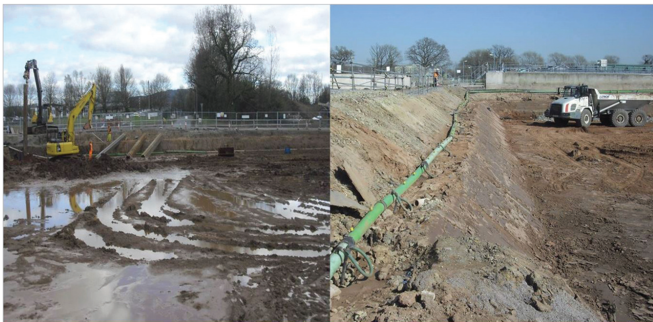
BEFORE GROUNDWATER CONTROL

W hen it comes to designing underground structures such as shafts, tanks and pipework infrastructure, it is essential that 'works designers' understand groundwater related issues. Although permanent works designs typically include measures to; counteract buoyancy, provide waterproofing, and to deal with the lateral and vertical stresses imposed by groundwater etc. The many risks presented by the presence of groundwater during the temporary works phase (i.e. the enabling works required for construction to take place) are typically not so well understood. As a consequence, the potential impact of groundwater risks to a project can go unrecognised.