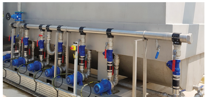
Crewe STW Evergreen cloth filter MSF 24/120 with external backwash pumps skid mounted