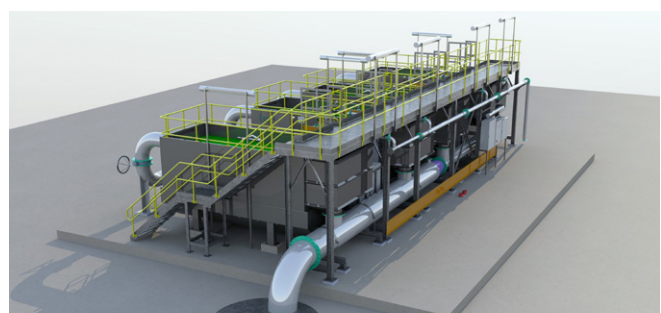
Crewe STW Evergreen cloth filter 3D render with outlet manifold