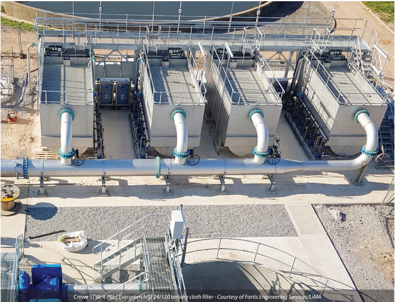
Crewe STW: 4 (No.) Evergreen MSF24/120 tertiary cloth filter

Tertiary treatment processes have been used for many years to polish effluent, reducing concentrations of suspended solids (TSS), BOD and ammonia in wastewater and effluent treatment plants. Changes in UK legislation including the introduction of the Water Framework Directive and Shellfish Directive has led to increased interest in nutrient removal (P+N) technology and increasing demand for tertiary treatment in the wastewater treatment process. Tertiary treatment is essential to maintain future compliance with ever tightening Environment Agency standards. Tertiary treatment options available for the municipal market include; cloth filtration, sand filtration, membrane bioreactors and UV disinfection. Using the Evergreen microfibre cloth filtration process it is possible to achieve TSS concentration as low as 0.5mg/l and consequentially achieve ultra-low total phosphorus (TP) concentration. Compared with other technology the high hydraulic capacity of the units makes it an economical option with a small footprint and low operating and maintenance costs.