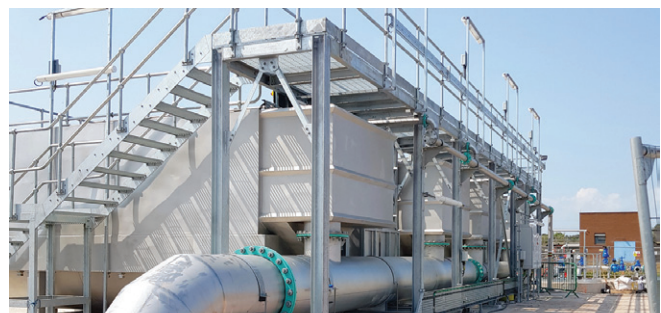
Crewe STW Evergreen cloth filter MSF 24/120 with outlet manifold